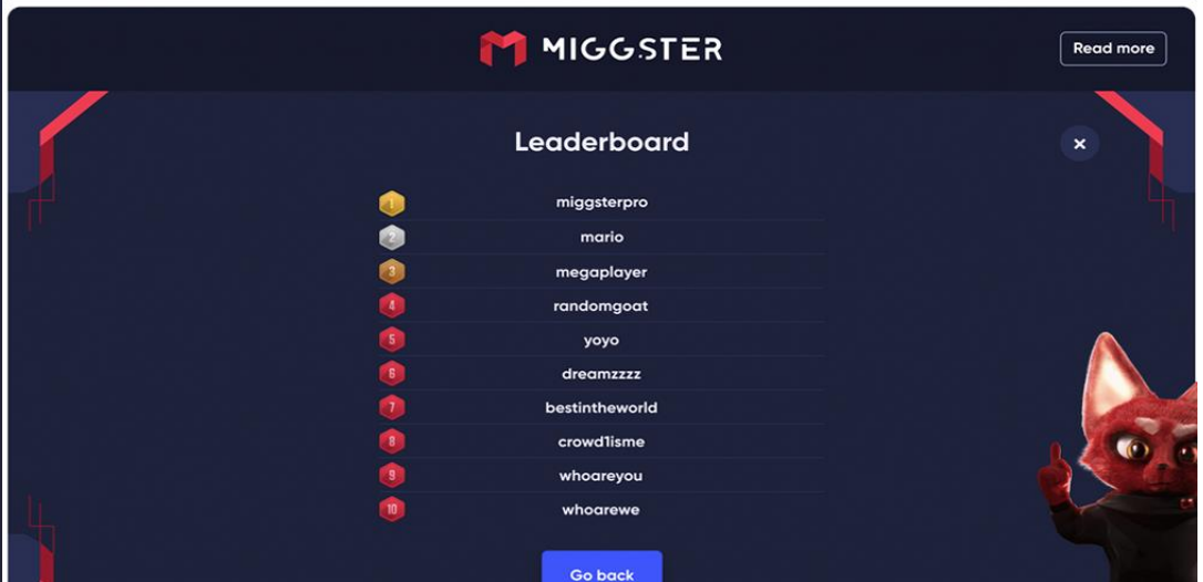
Figure: Miggster user pre-registration screens from miggster.com