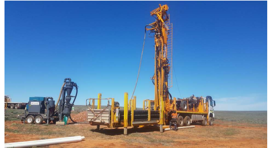
Figure 1: Drilling rig on site drilling the first hole on the Pernatty project area

Tasman advises that following long delays due to rain caused road closures, the drilling program at its 100% owned Pernatty project in South Australia has finally commenced (see Figure 1).