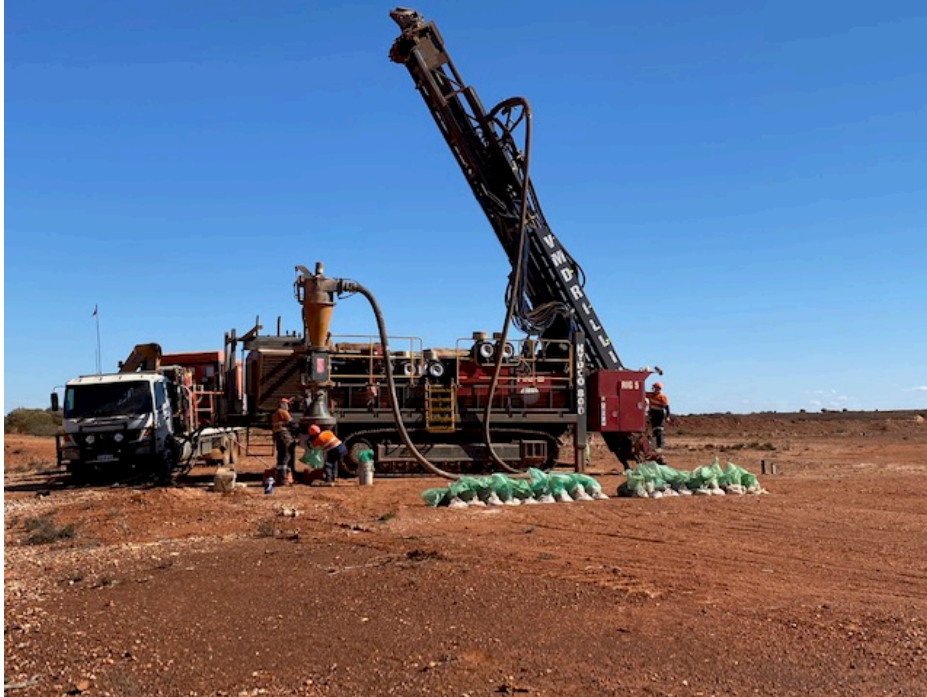
Figure 1: RC Drilling Rig on site at Gum Creek Gold Project

The drilling program will comprise a total of 38 RC holes for 4,680 metres. The program will consist of infill and extensional drilling to improve definition of the modelled mineralisation and to target extensions to the Swan and Swift Mineral Resource (refer to Appendix 1 for further details).