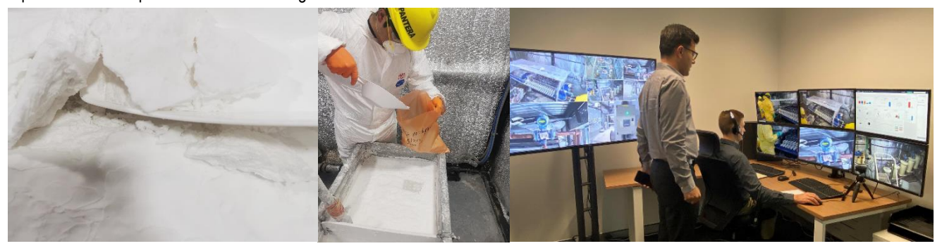
Figure 2: Sal de Vida brine produces technical grade lithium carbonate (left and centre) and piloting is monitored from Perth's operations centre (right)

The pilot plant was successfully commissioned in the previous quarter and all stages, including brine distribution, ponds, liming, softening and carbonation are operational and effective. The first full run from evaporated brine through all process stages to final product has been completed. Assaying of the final product has shown lithium carbonate purity of 99.5-99.7% combined with low levels of impurities. This meets technical grade specifications and other outcomes to date are also in line with targeted processing parameters and continue to validate the process design assumptions. Ongoing piloting activities will focus on increasing continuous operating hours and producing representative samples for customer testing.