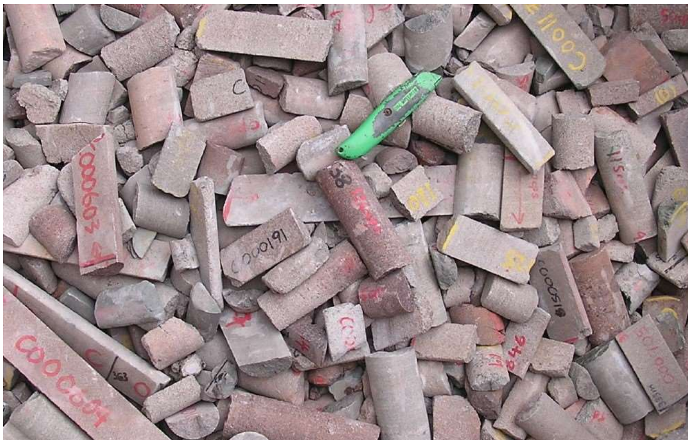
Figure 3 – Photo of NQ Core Used in Testwork Program

Removal of the calcite mineral was successful from the first metallurgical test. Minor changes were made to subsequent test conditions to generate sufficient product mass to complete acid leach tests on samples pre and post calcite removal, in order to confirm the expected reduction in acid consumption. The bulk of the calcite (84% of the total minerals present) was recovered into a reject fraction grading 92% calcite and containing 9% of the feed mass, resulting in 91% of the mass and 16% of the calcite reporting to the leach stage.