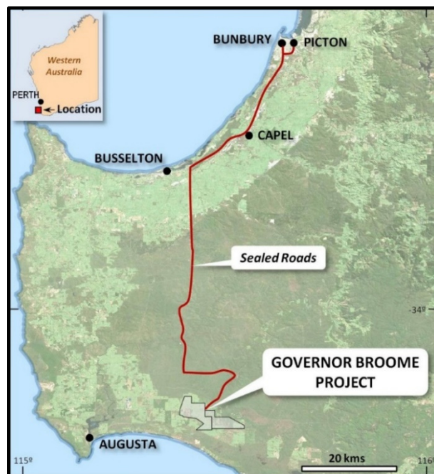
Figure 4 Governor Broome Project - Location

Astro's Governor Broome Mineral Sands Project is located in the southwestern region of Western Australia. The project is broken up into two parts: R70/53, 100% owned by Astro Resources, and R70/58, which is the subject to the Farm-in and Joint Venture Agreement with Iluka Resources Limited (Iluka Joint Venture). See below for further details.