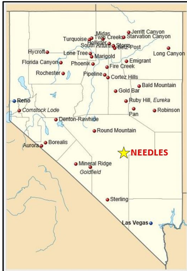
Figure 1 Astro's Needles Property Nevada USA – Location, with active gold mines

Following the successful capital raising completed during the quarter, the Company commenced exploration work on the western portion of the Needles Project, located in Nevada USA (figure 1).