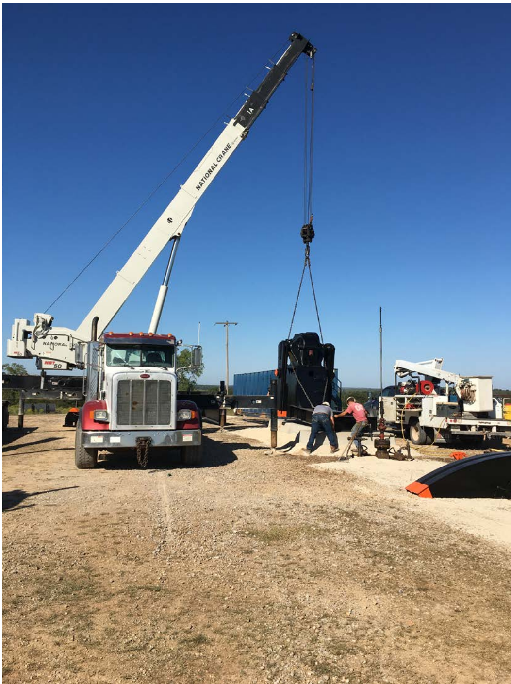
Figure 2. Production equipment being installed on the Mitchell Well in Carter County, Oklahoma

The Company is closely monitoring the continuing stability in the oil and natural gas prices and based on the very strong economics of the SWISH AOI acreage, is ready to respond quickly with development plans for the SWISH AOI.