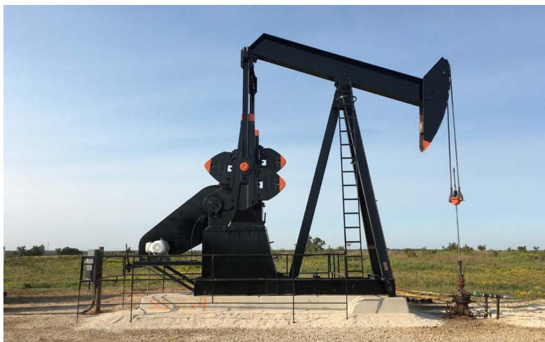
Figure 3. Pumping unit installed on the Mitchell Well in Carter County, Oklahoma