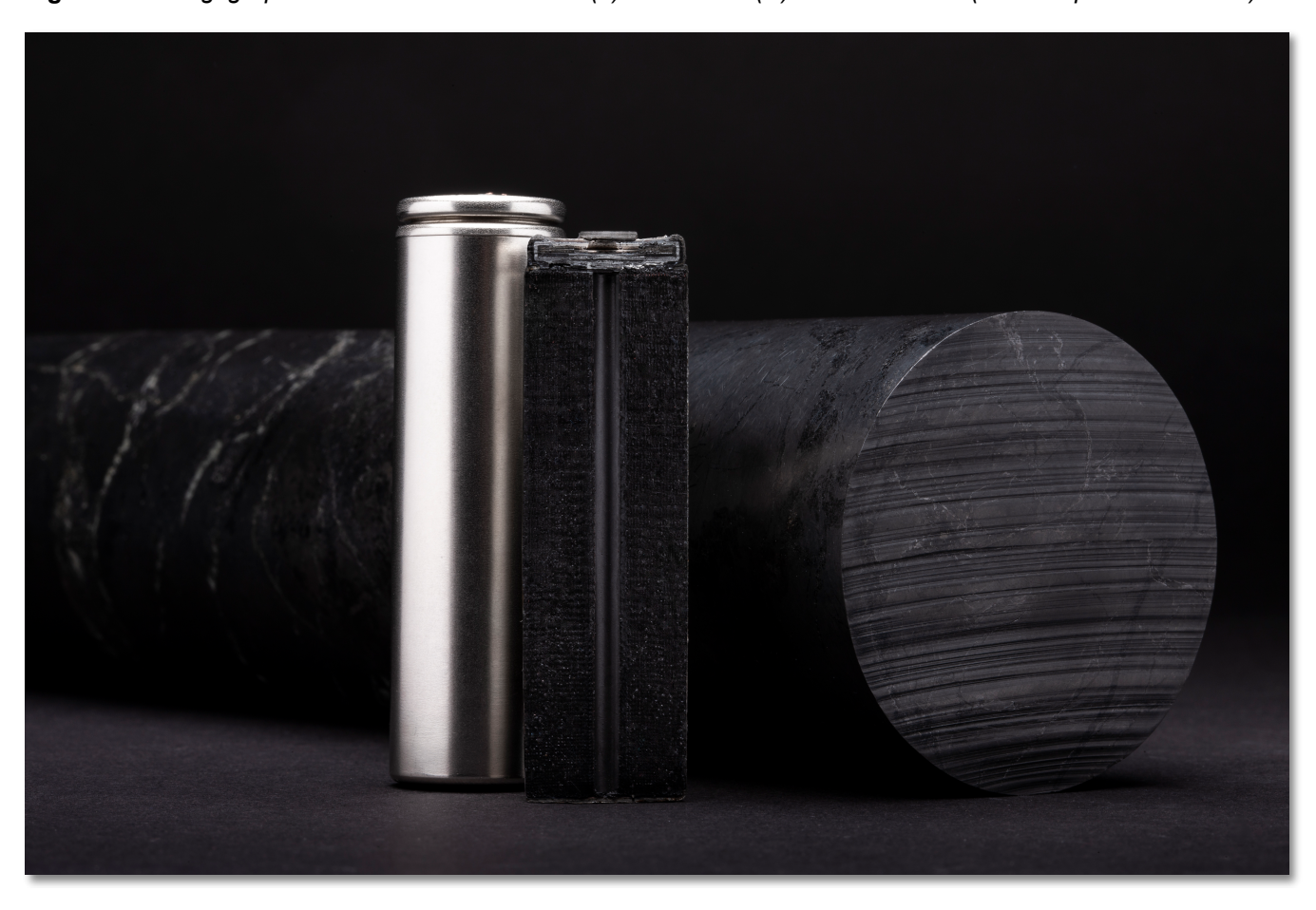
Figure 6. Vittangi graphite drillcore with size 2170 (L) and 18650 (R) Li-ion batteries (cut to expose the anode).

This continued growth in graphite resources positions Talga for an increasingly significant role in battery anode production for the booming electric vehicle markets. As an approximate guide there is ~1 million tonnes of graphite anode per 20 million electric vehicles, and the European Commission has classified graphite a Critical Raw Material necessary for the transition to a more sustainable society.