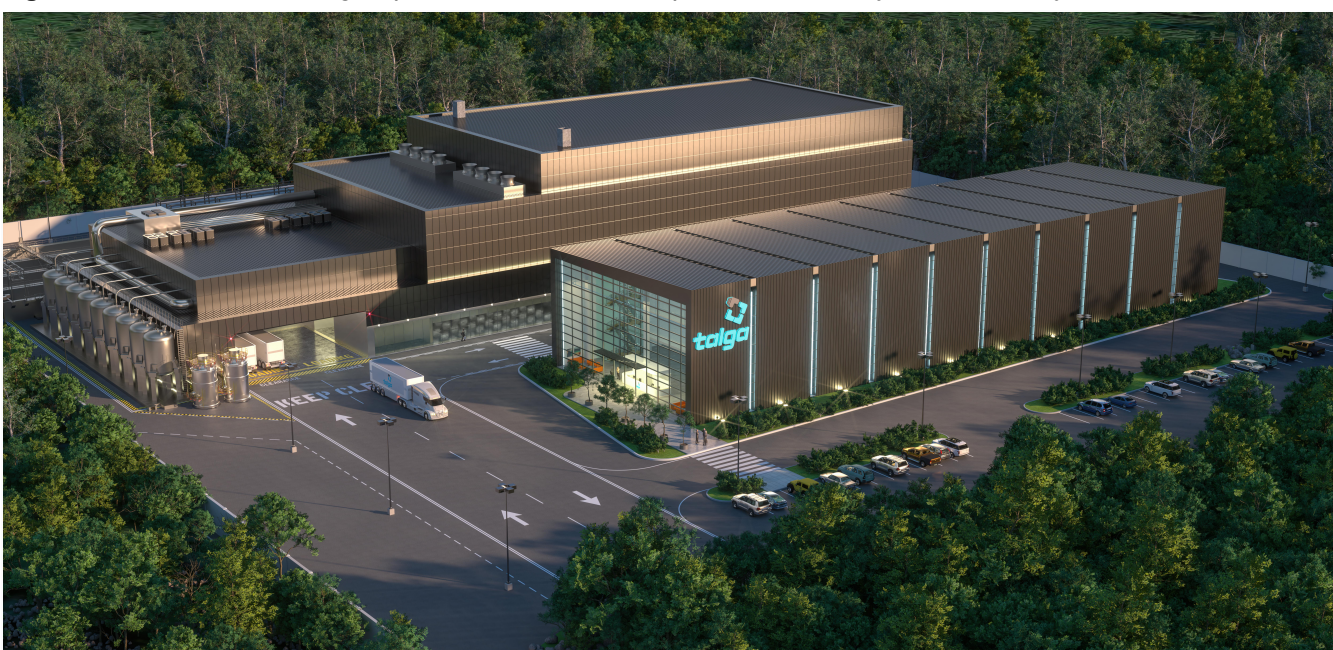
Figure 1. Visualisation of Talga's planned 19,000 tonnes per annum battery anode refinery.

Talga will look to further refine these outcomes in the upcoming commercial Detailed Feasibility Study ("DFS") planned for completion in Q1 2021.