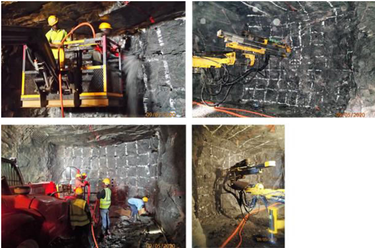
Figure 2: Underground drill and blast work underway. Top right and bottom right: drilling blast holes on a regular grid pattern; Top left: cleaning drilled holes; Bottom left: charging blast holes.