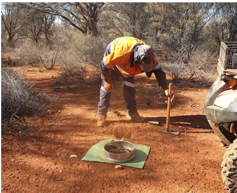
Figure 3: Soil sampling in progress at Kookynie Gold Project