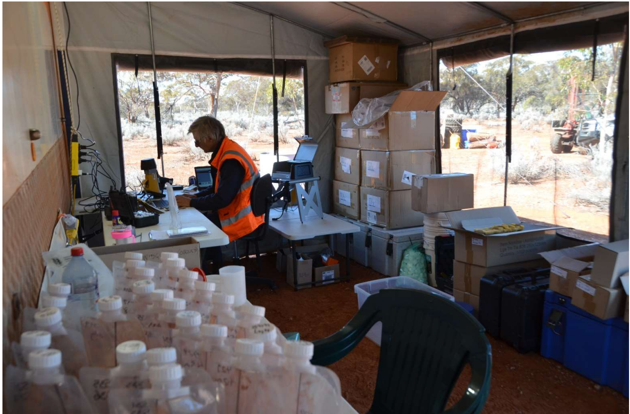
Figure 2: detectORE™ beta trial, Cutler and Farr-Jones area, August 2020

Originally, Riversgold signed a sponsorship agreement with Portable PPB in August to assist with Beta Trials of the technology at the Kurnalpi Project. The decision to considerably upgrade the sponsorship level came following trials at Cutler and Farr Jones using the technology.