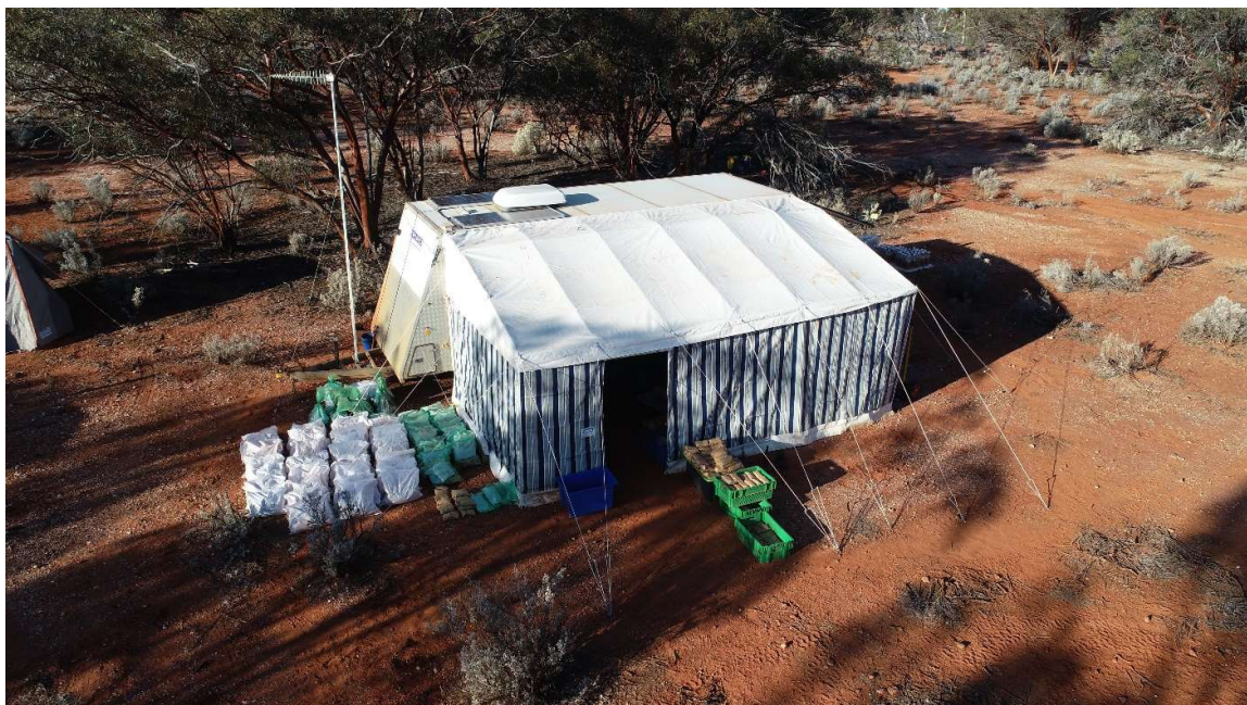
Figure 1: Portable PPB mobile facility near Cutler

DetectORE™ allows the detection of low-level gold concentrations (down to ~10ppb) using a conventional portable XRF analyser. PPPB is developing the technology and following the sponsorship upgrade RGL will have the highest priority to the technology and will be the first junior explorer to gain access to the many gold sponsor benefits, including field trials and a large number of the single shot consumables ("widgets") used by the technique.