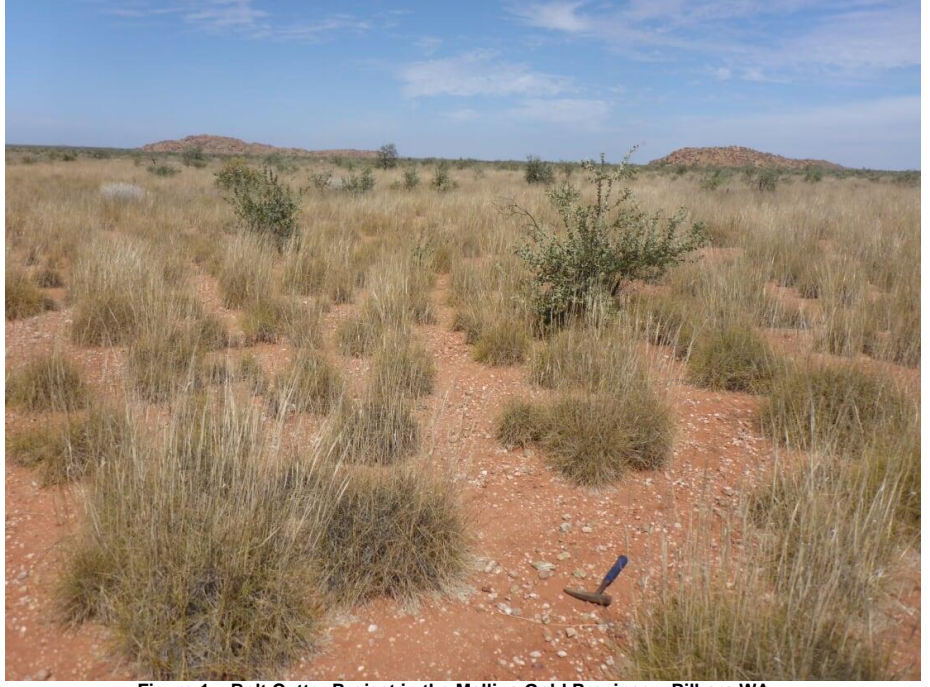
Figure 1 – Bolt Cutter Project in the Mallina Gold Province – Pilbara WA

The recent discovery of the Hemi gold deposits by De Grey Mining Ltd (ASX:DEG) has uncovered a major new gold system in the Mallina Gold Province. The Mallina Basin is a large and highly prospective gold province and the recent exploration success suggests that the Province is highly prospective. The exploration maturity of the Mallina Basin is lower than many other gold regions in WA, and recent exploration successes there may indicate that there is significant untested potential in the region.