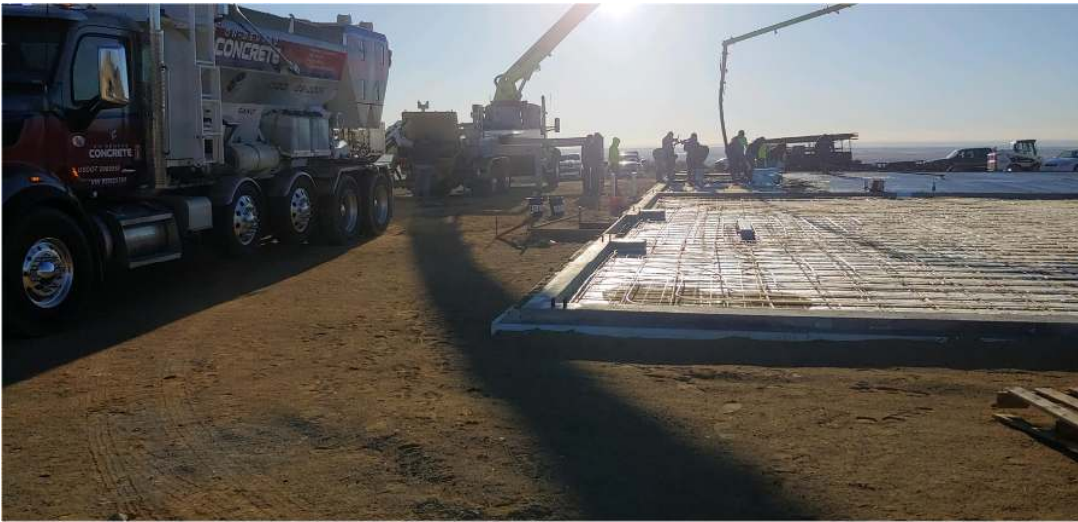
Figure 1. Volumetric truck mixing at the Loveland project site

EdenCrete® is being used for the first time in a volumetric truck batching and pumping project that commenced in November 2020 with On Demand Concrete, at Loveland, in Colorado (see Figure 1).