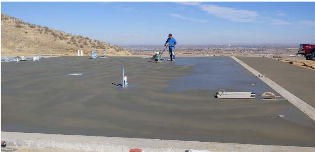
Figure 2. Finishing the concrete surface at the Loveland project

The concrete was finished to hard trowel mirror and produced a very good surface. All present were impressed with the ease of EdenCrete® finish ability (see Figure 2).