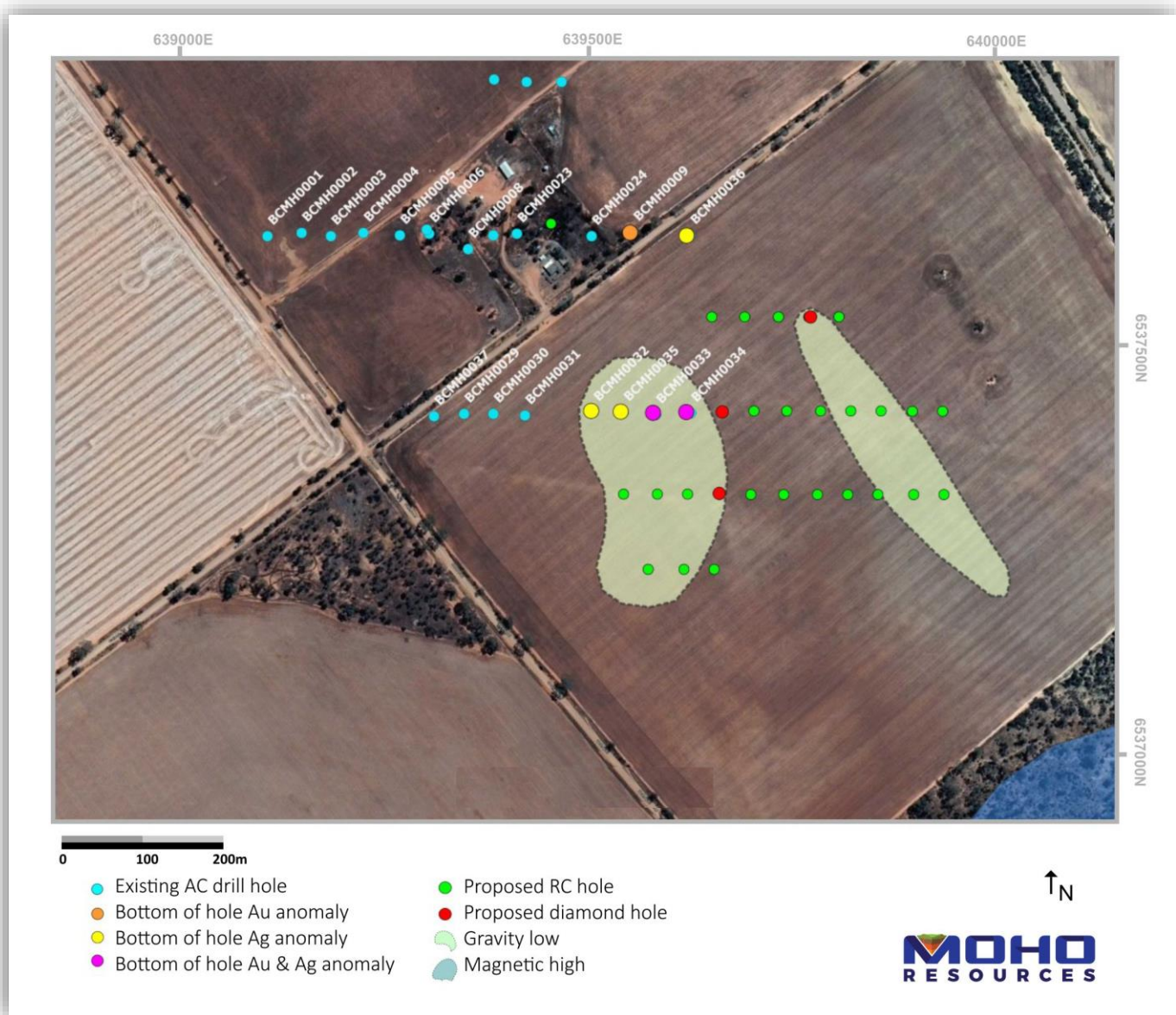
Figure 2: Proposed RC and diamond drill hole collars, Crossroads gold prospect