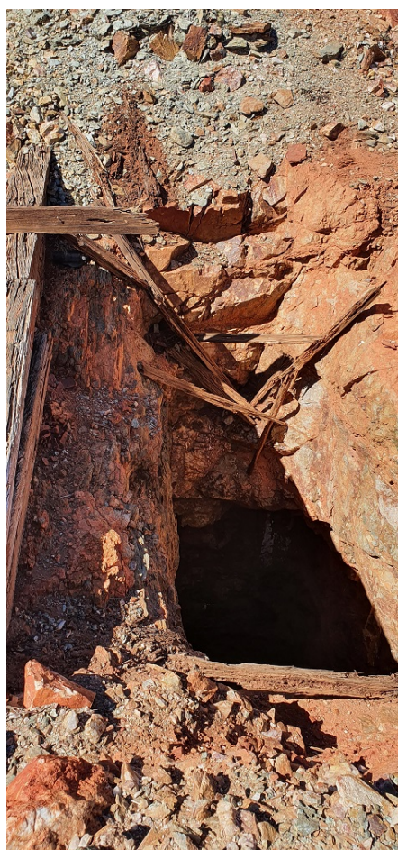
Photos 1 & 2: Examples of trenches and a shaft from Cracker Jack project (P20/2289), indicating the targeting of epigenetic gold mineralisation over a ~300m zone.