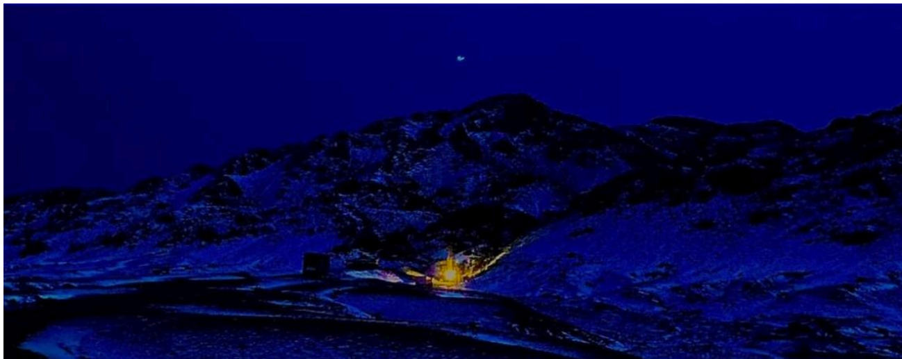
Yangir 1S in the Gobi night

The Yangir 1S strat-hole well has been terminated at just over 347 metres and the site has now been remediated. The drilling of the well suffered from various mechanical problems which, despite a number of different efforts, could not be remedied due to recent COVID related restrictions imposed on the movement of equipment and people in Mongolia.