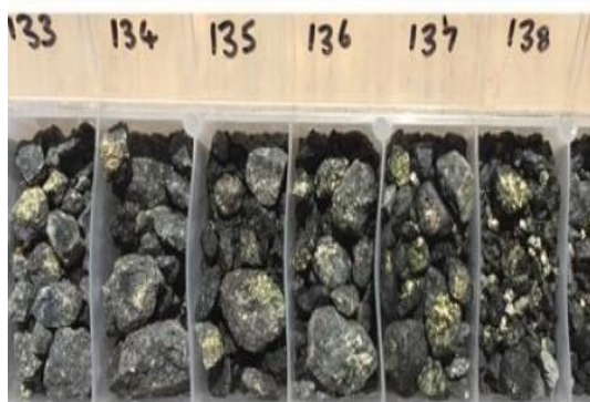
Photo 1. Massive sulphides TR17RC07

The recent Diamond Core drill hole TR20DD001 drilled at the Trump Project was drilled at near right angles to the NE/SW trending Trump orebody (identified by 500m of prominent outcrops) to intersect and geologically evaluate the zone and structures of the high grade Gold found in RC drill hole TR17RC07. The hole was also drilled to test the width of the orebody identified by RC drill hole TR17RC07, that intersected and proved 153m of continuous Copper mineralization commencing from surface, including the 6m 32.90g/t Au from 75-81metres depth (ASX: AMG 28 th August 2018).