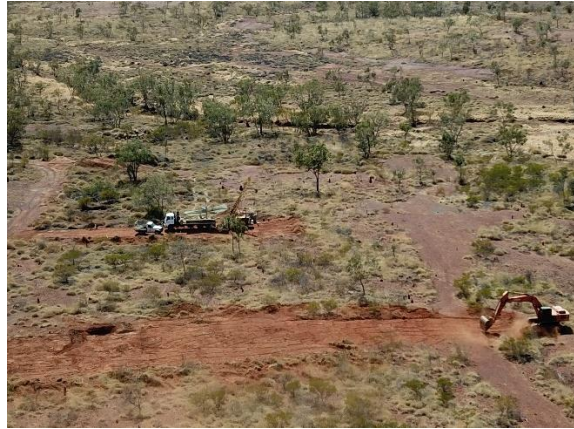
Photo 4. Drill pad construction at the Trump