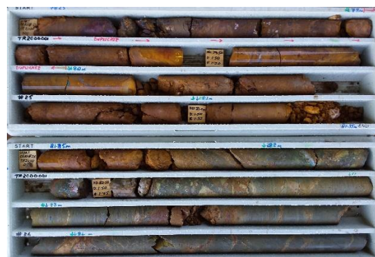
Photo 2. Gold ore zone TR20DD001