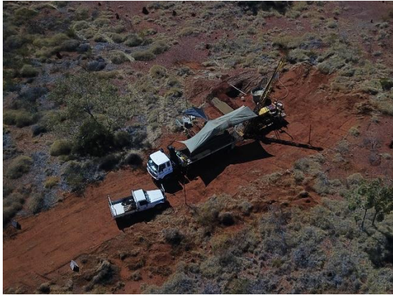
Photo 3. Diamond drilling at the Trump