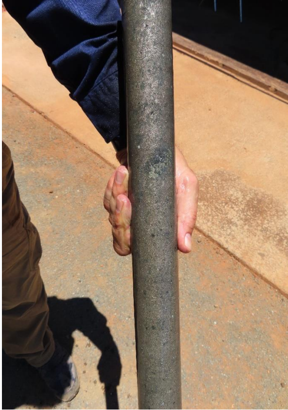
Figure 1: ANDD0004 drill core Massive Ni-Cu sulphides @ 357.0m - 358.0m 1.0m @ 4.05% Ni & 0.22% Cu