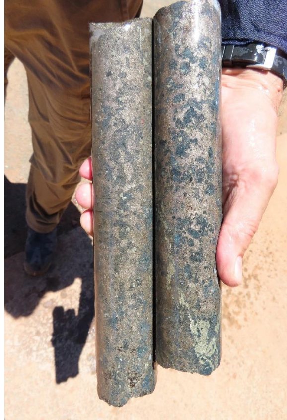
Figure 2: ANDD0004 drill core Matrix Ni-Cu sulphides @ 352.9m - 353.6m 0.7m @ 2.64% Ni & 0.27% Cu