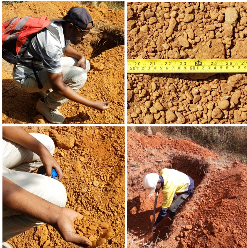
Photo 1. Screening and pitting activities

This ASX announcement was authorised for release by the Lindian Board.