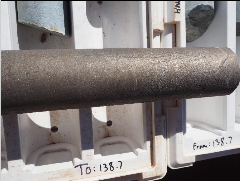
Photo 2 – Close up of nickeliferous massive sulphides in drill core in HNDD003: 2.41% Ni, 0.47% Cu and 0.46g/t Pd

This announcement has been authorised by the Board of Directors of the Company.