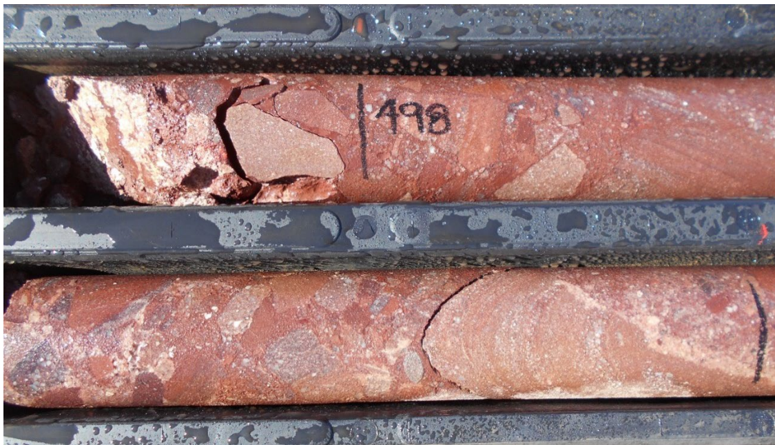
Above and Below: DD20EB0002 encountered haematitic fault breccia within the Pandurra Fm. Copper sulphides were logged in vugs, with elevated copper grades confirmed by portable XRF, confirming the fault as having carried copper and iron bearing fluids.