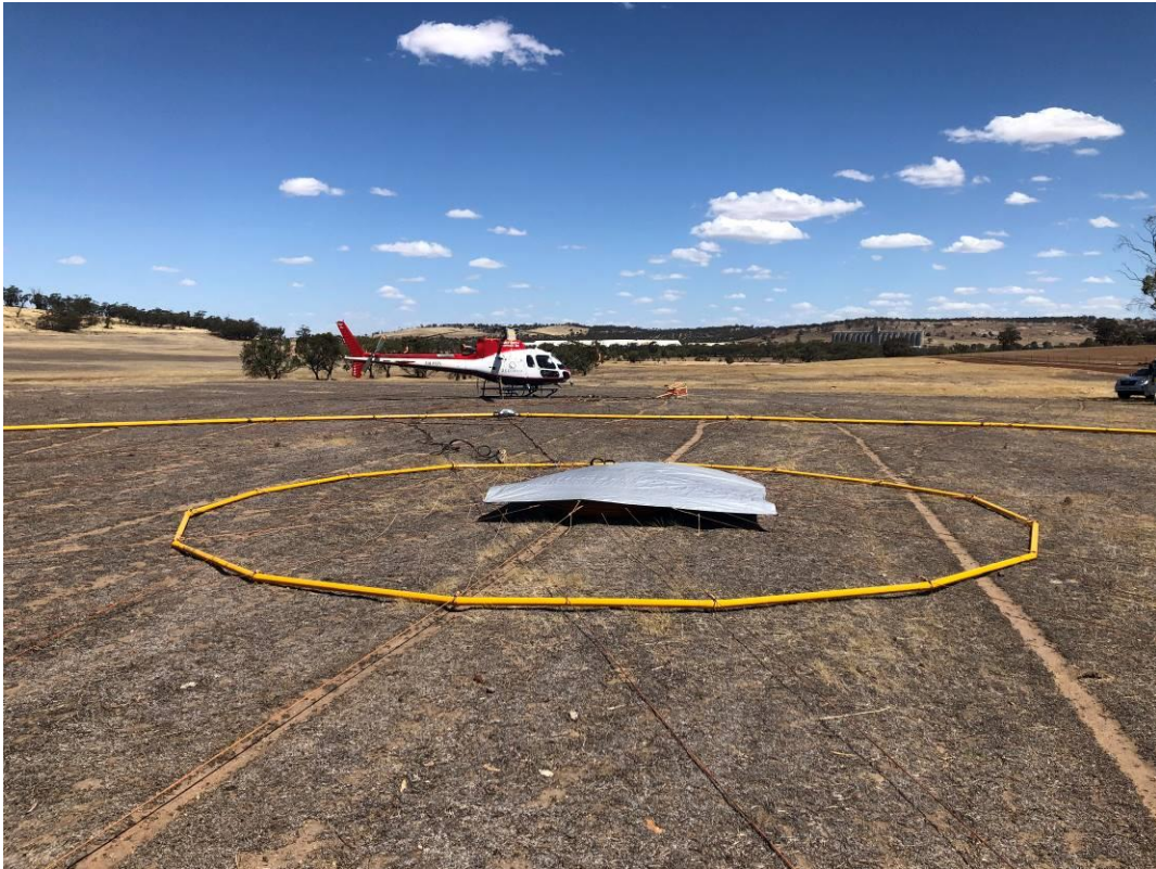
Plate 1 – AEM Loop