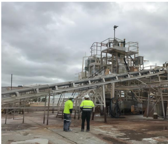
Figure 3: Pittong processing plant facilities