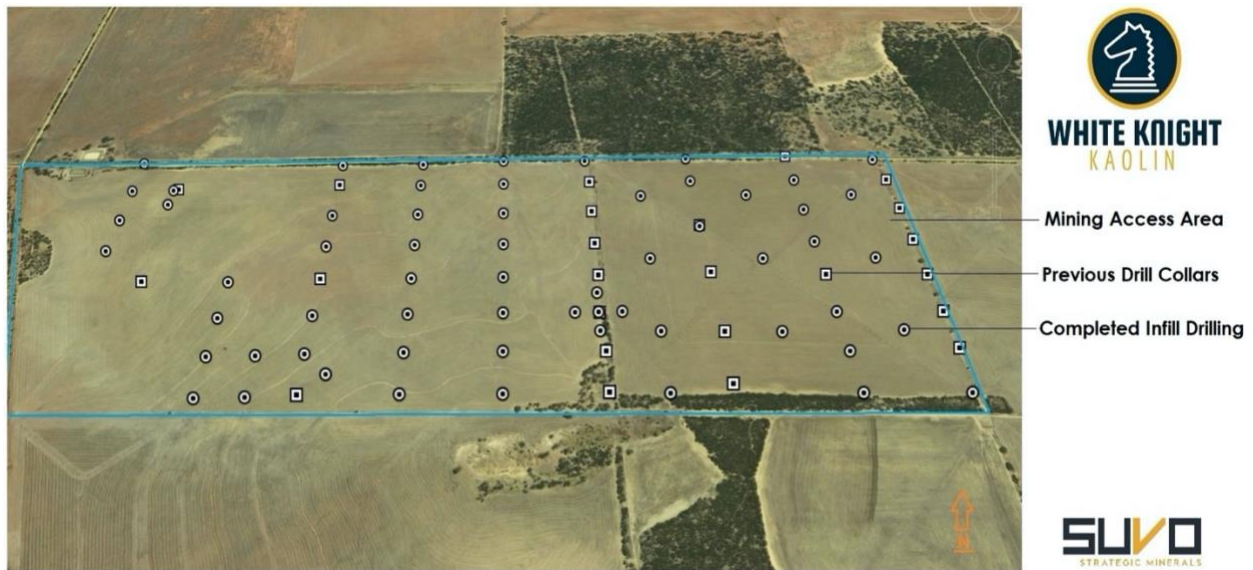
Figure 6: Gabbin drill hole locations.