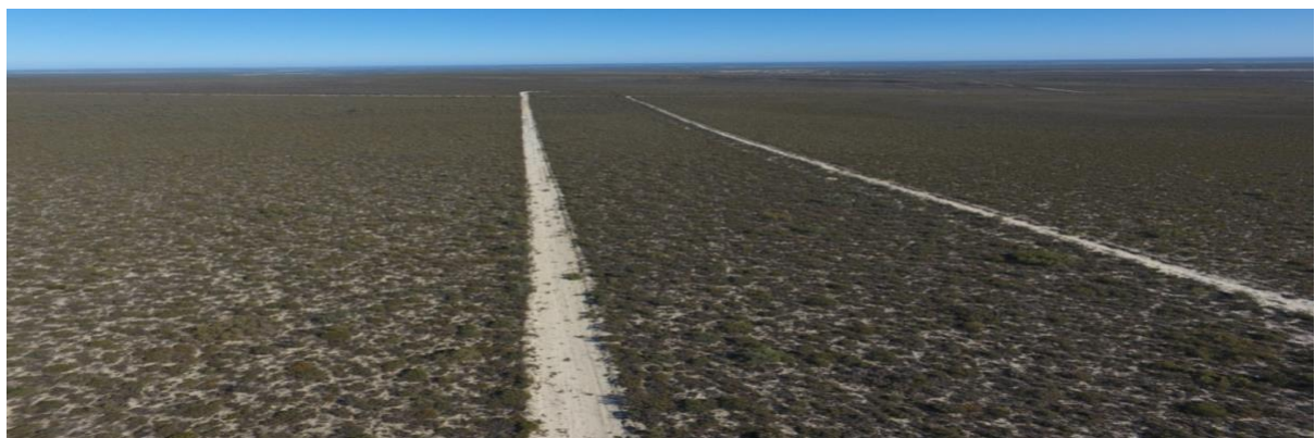
Figure 7: Aerial photo of Suvo's Nova Silica tenements.

Depending on detailed analysis of the drilling campaigns, further flora and fauna surveys are planned for March and October 2021.