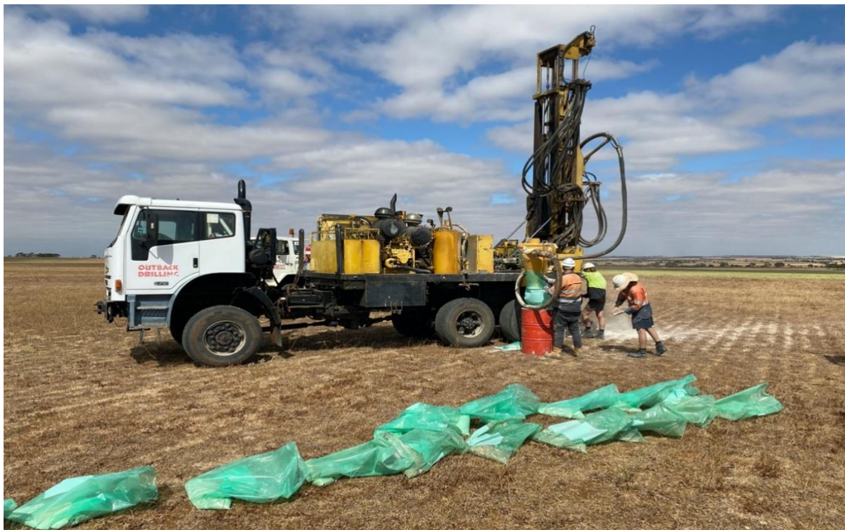
Fig 5 Drilling at Suvo's 100% owned White Knight kaolin deposit

The Company is actively interviewing candidates for the role of General Manager of Global Technical Sales to progress product development, marketing, sales and distribution of Suvo's White Knight Kaolin products globally. The choice of a final candidate is expected in mid-January 2021.