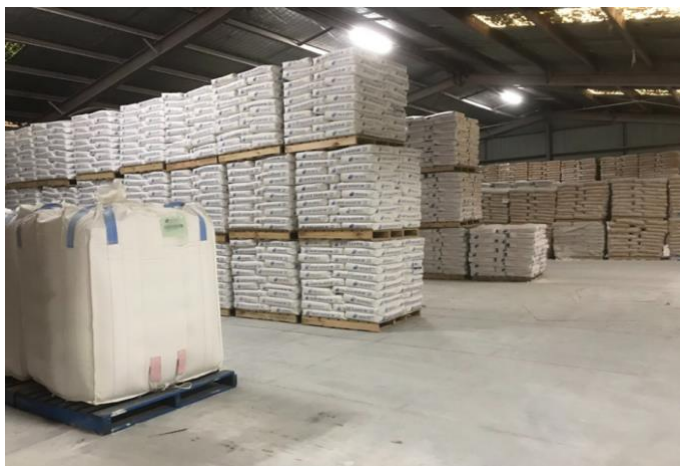
Figure 4: Finished kaolin products ready for dispatch