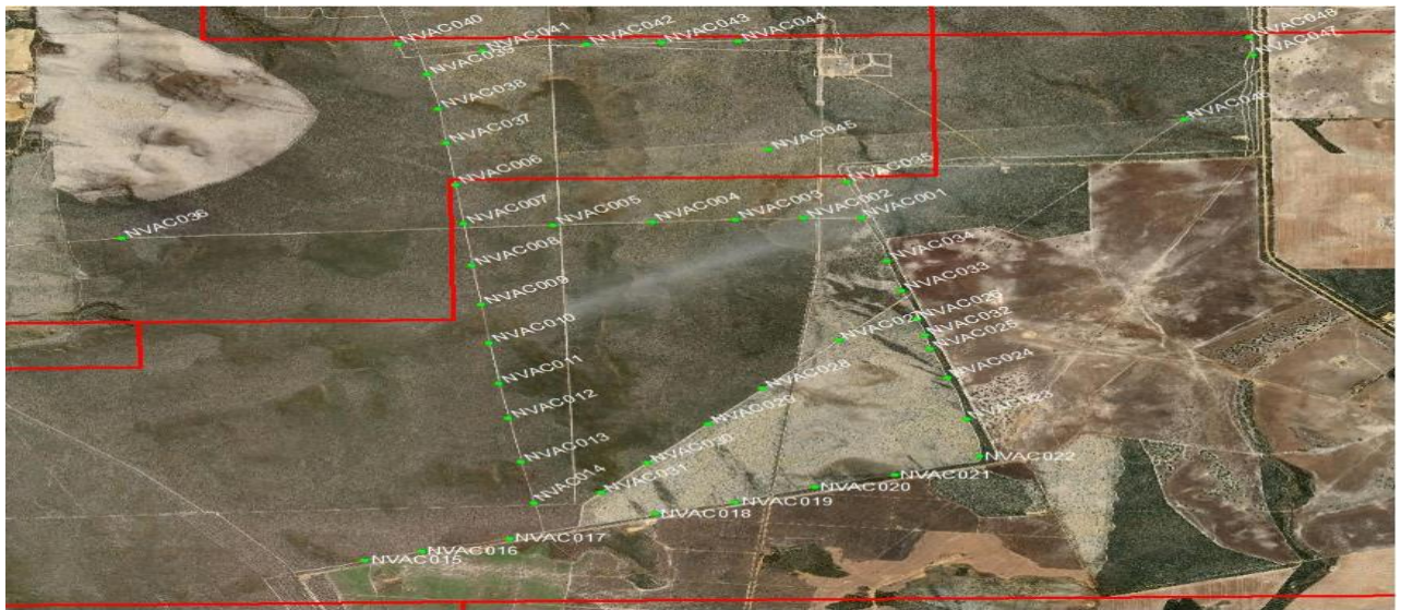
Figure 8: Drill collar locations at Suvo’s maiden drilling campaign at the 100% owned Nova Silica tenements.