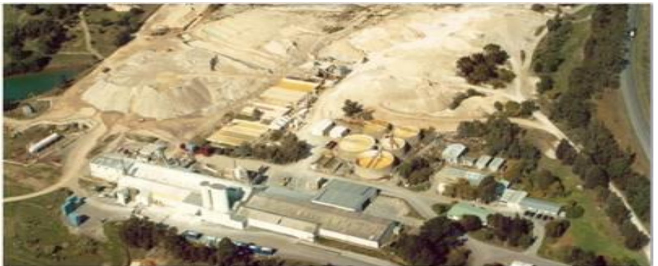
Figure 1: Pittong processing plant facilities

If shareholders vote in favour of the transaction Suvo expects to conduct a full strategic review of the operations in conjunction with a full detailed JORC resource identification program to help assess the development potential for upgrading, modernising and increasing the output of the plant. The results of the strategic review and the JORC resource identification program are expected to be completed by 30 June 2021.