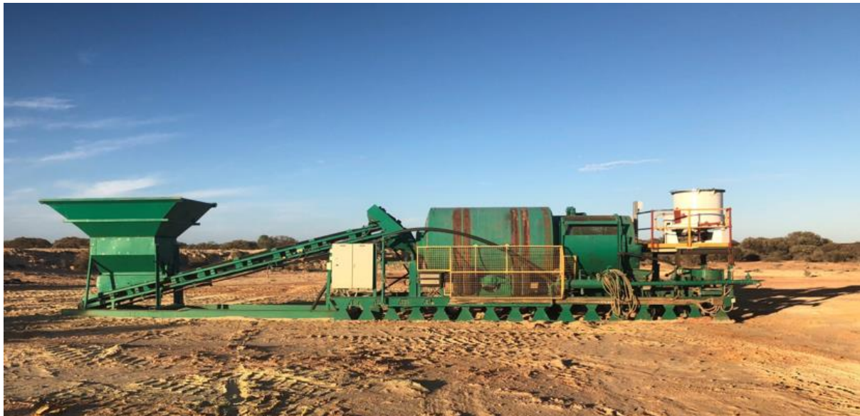
Photo 1: Equipment as arrived on site next to the historical Cosmopolitan Mine foundations and Dump 5.