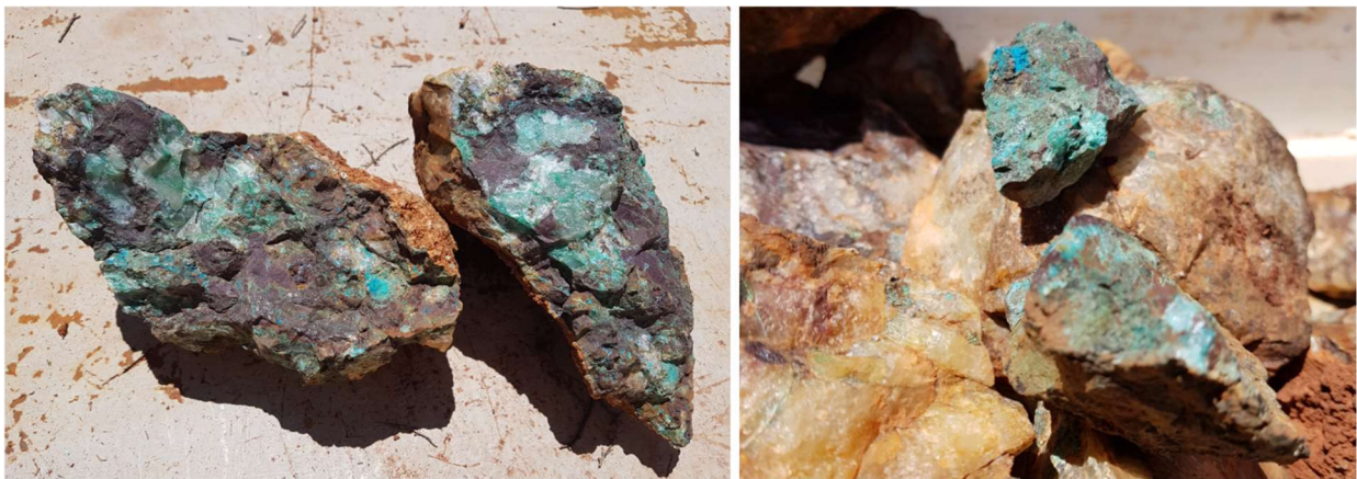
Images 1 & 2 | Stark gossan samples collected during RC collar mark out

Cyprium Metals Limited (“CYM”, “Cyprium” or “the Company”) is pleased to advise that it has commenced a Reverse Circulation (“RC”) drilling programme at the Nanadie Well Copper-Gold Project. This programme continues Cyprium’s strategy to drill out the resource at the Nanadie Well Copper-Gold project as detailed in Figure 1.