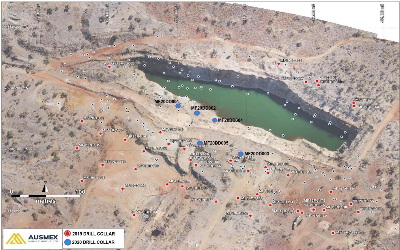
Figure 2. Drill collar plan of Mt Freda (pit now de-watered).