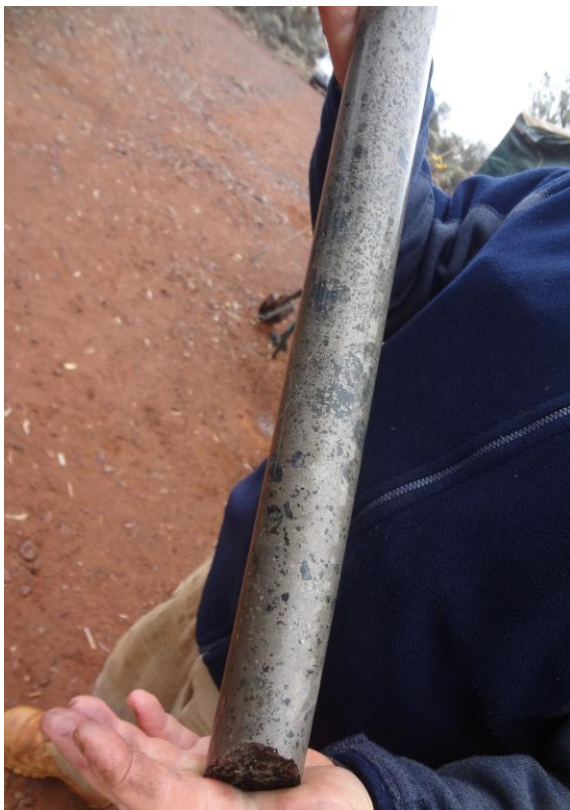
Picture 2. Massive Ni/Cu Sulphides drilled T5.

A “Voisey Bay” style model has not been adequately explored within the CBLC. This represents a compelling exploration target opportunity which the Company will continue to aggressively pursue.