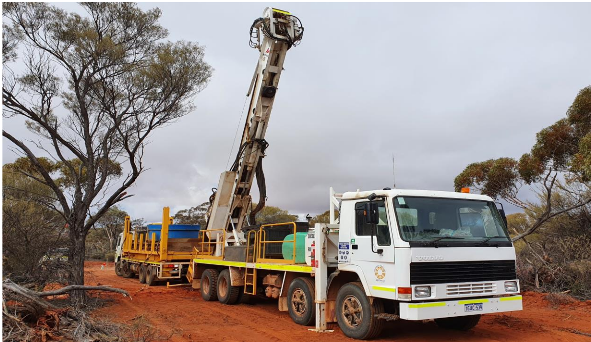
Picture 1. Diamond drill rig located over the T5 Ni-Cu discovery zone in 2020.

T5 discovery to be drill tested further at depth and along strike Estrella Resources Limited (ASX: ESR) (Estrella or the Company) is pleased to provide an update on the Carr Boyd Nickel Project (CBNP or the Project). The CBNP is comprised of the Carr Boyd Layered Complex (CBLC or the Complex).