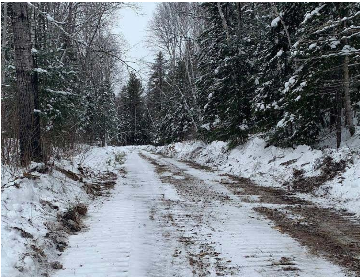
Figure 2: Road clearing underway at Edleston

We are eagerly awaiting the commencement of the maiden drilling campaign at Edleston. The diamond drill rig is scheduled to arrive on site towards the end of January."