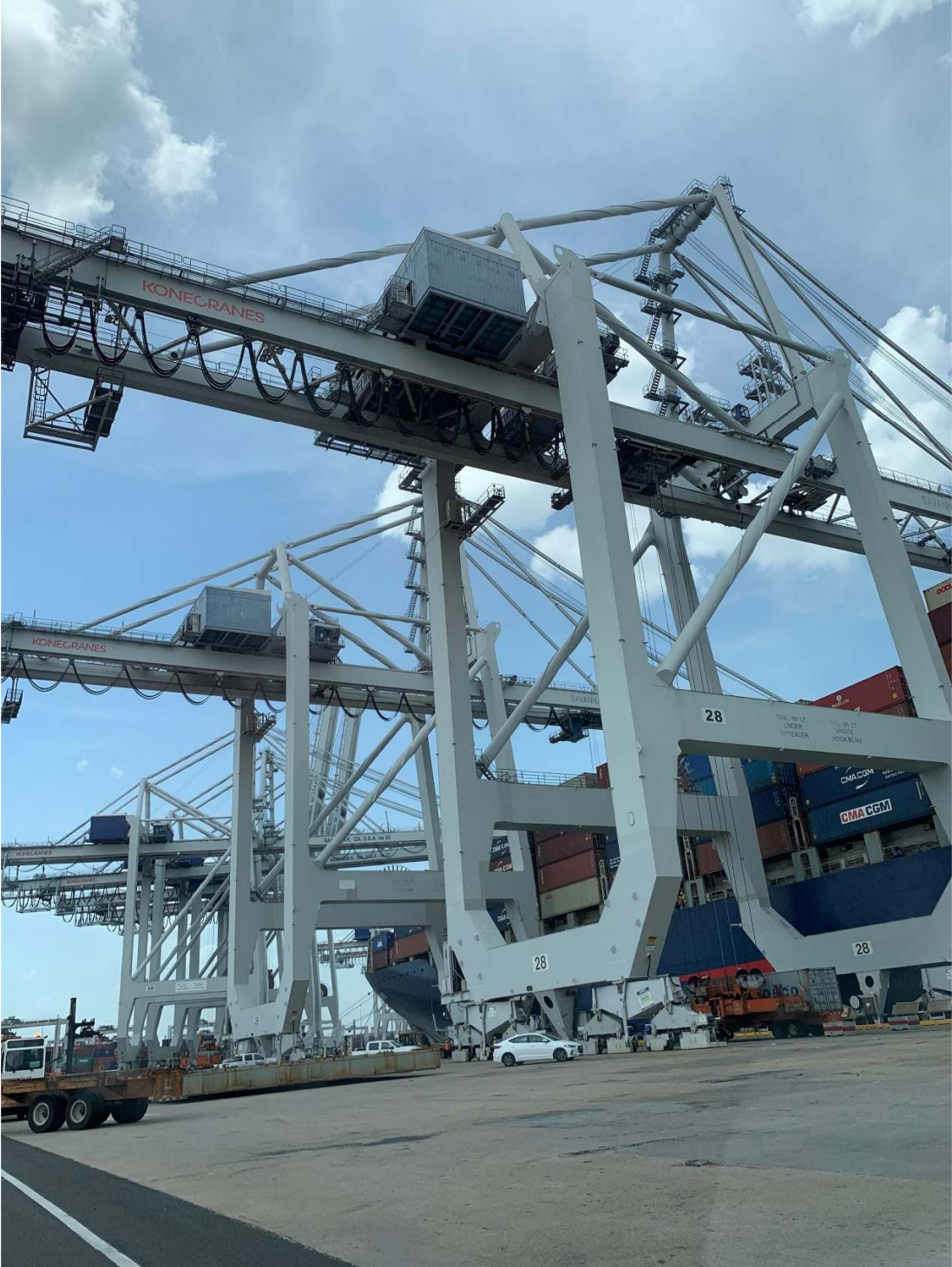
Figure 2. Some of the ship-to-shore cranes operating at Port of Savannah

By 2027, the additional cranes, revamped dock space and a new Hutchinson Island terminal are planned to allow the Port of Savannah to significantly increase big ship capacity of the port. In 2020 the terminal was scheduled to receive six additional Ship to Shore (STS) cranes (see Figure 2), and bring its fleet to 36, more than any other terminal in North America.