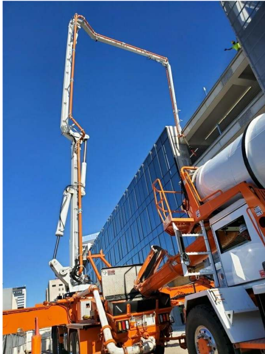
Figure 5. Pumping EdenCrete® concrete to fourth floor level of carpark

The project was completed shortly after the end of the quarter and all parties involved were extremely pleased with the performance improvements and other benefits that the EdenCrete® delivered and as a result three new ready-mix companies in the Wichita area are now trialing EdenCrete® in their concrete mixes.