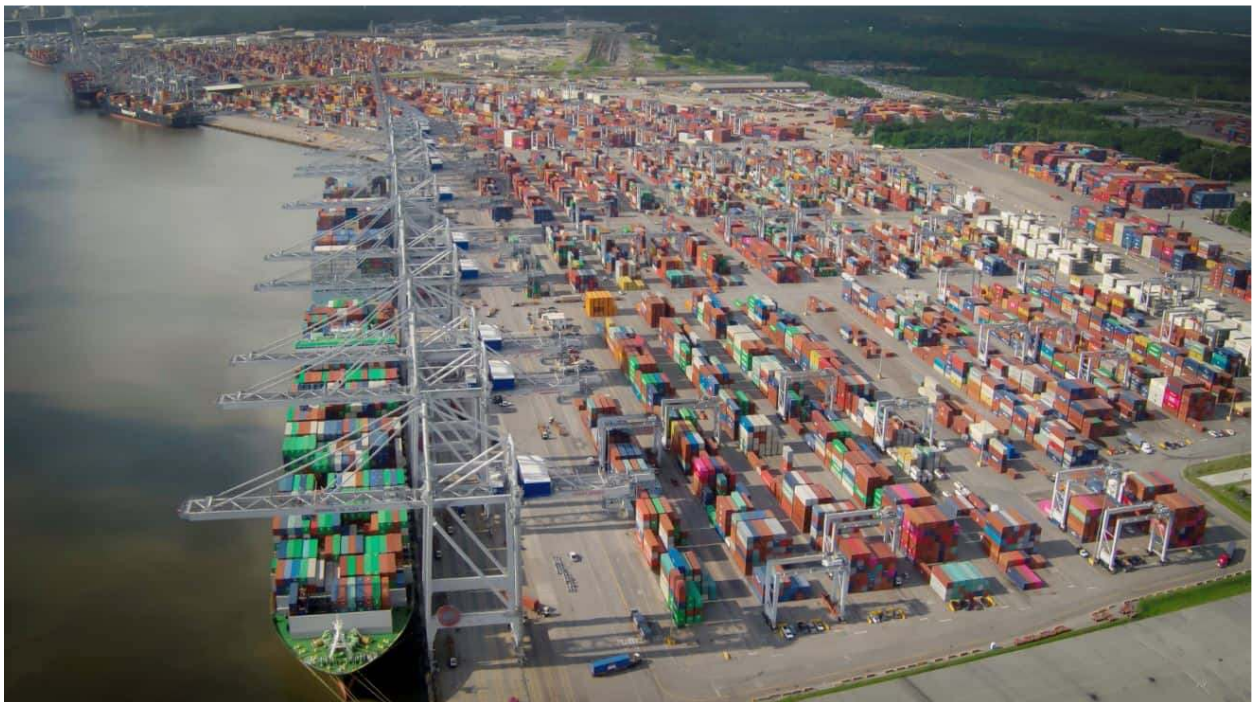
Figure 1. Garden City Terminal

EdenCrete® has now been expressly pre-approved by GPA for use in first project that is currently being tendered as the first project being undertaken in the 8-year, US$2.5 billion expansion project that will double the capacity of the Port of Savannah. Eden is currently engaging with all regional ready-mix suppliers and contractors to ensure they are aware of the earlier success of EdenCrete®. Based on the dosage rate used in the EdenCrete® trials, if EdenCrete® is used by the successful tenderer, the project would require approximately US$625,000 of EdenCrete®. Bids are scheduled to close in early February 2021. The first project is the re-alignment of Berth 1 to allow docking for more 14,000 TEU vessels on the downriver end of the terminal (see Figure 1.).