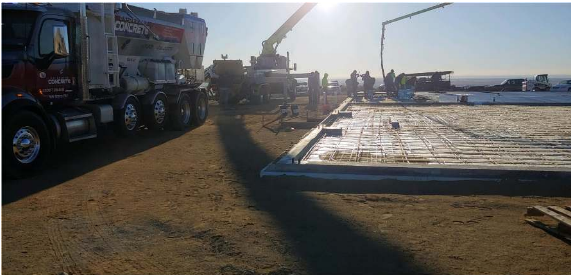
Figure 3. Volumetric truck mixing at the Loveland project site

EdenCrete® was used for the first time in a volumetric truck batching and pumping project that commenced in November 2020 with On Demand Concrete, at Loveland, in Colorado (see Figure 3).