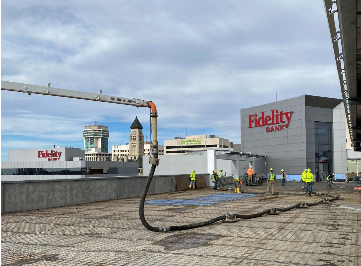
Figure 6. Installing top deck of car park