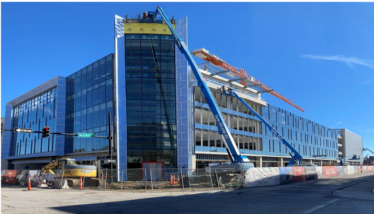
Figure 4 - Rise project in Wichita, Kansas.

Phase two will be the construction of The Tower, a 10-story building with 135,000 square feet (12,542 square metres) of floor space, including a large rooftop green space featuring grass and trees, on the site of the original parking deck. Upon completion the new carpark will be connected to The Tower by a two-story walkway.