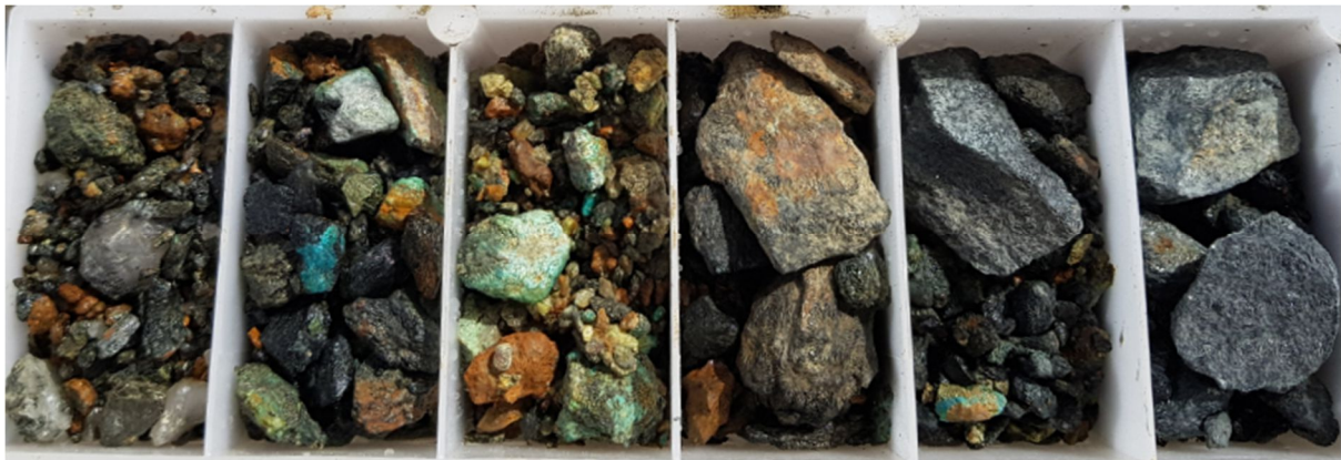
Image 3 | Nanadie Well RC Drilling Rock Chips: NWRC21018 (NWDES148) 21-26m (refer to Table 1 for location)