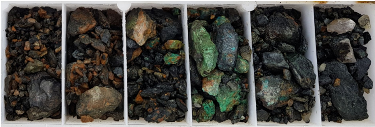
Image 2 | Nanadie Well RC Drilling Rock Chips: NWRC21018 (NWDES148) 15-20m (refer to Table 1 for location)

The mineral resource delineated by these programmes will be included in the ongoing Murchison Copper-Gold Project scoping study. The results from these programmes will be also be used in the planning of follow up drilling programmes which will target mineralisation extensions as it remains open at shallow depths, to the north, south and to the west.