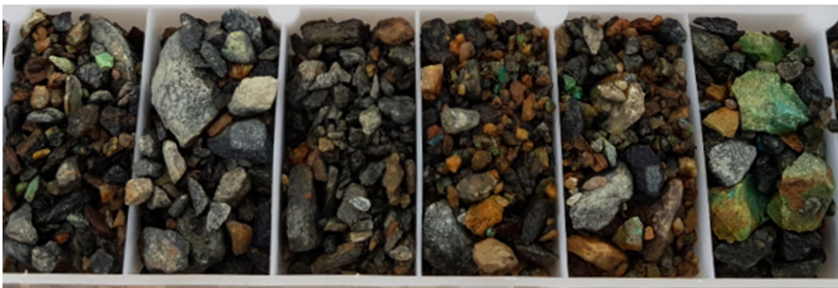
Image 7 | Nanadie Well RC Drilling Rock Chips: 23m-28m NWRC21038 (NWDES130) (refer to Table 1 for location)

This ASX announcement was approved and authorised by the Board.