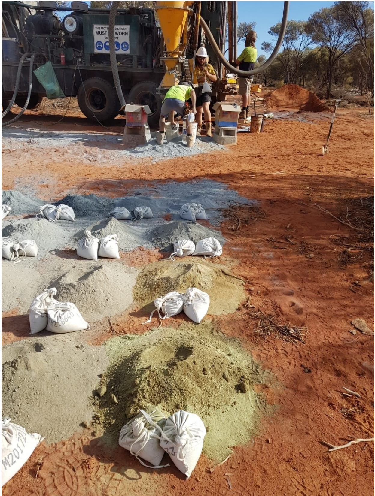
Image 5 | Nanadie Well Copper-Gold Project Reverse Circulation drilling