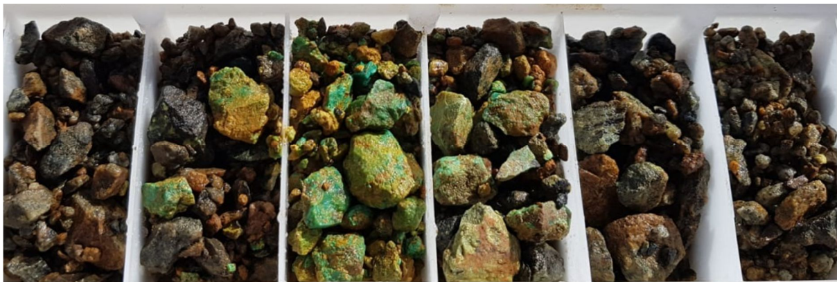
Image 4 | Nanadie Well RC Drilling Rock Chips: 8-13m NWRC21031 (refer to Table 1 for location)