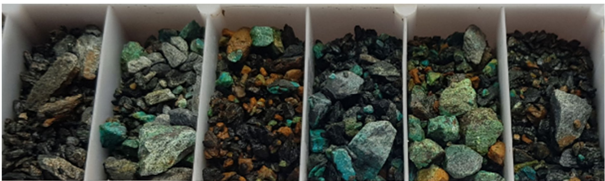
Image 1 | Nanadie Well RC Drilling Rock Chips: NWRC21011 (NWDES152) 25-30m (refer to Table 1 for location)

Cyprium Metals Limited (“CYM”, “Cyprium” or “the Company”) is pleased to provide an update of the Reverse Circulation (“RC”) drilling programme that was commenced on January 6, 2021 at the Nanadie Well Copper-Gold Project. This programme continues Cyprium’s strategy to drill out the resource at the Nanadie Well Copper-Gold project as detailed in Figure 1.