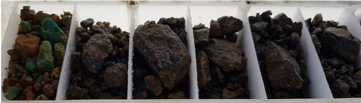
Image 6 | Nanadie Well RC Drilling Rock Chips: 20m-26m NWRC21031 (refer to Table 1 for location)