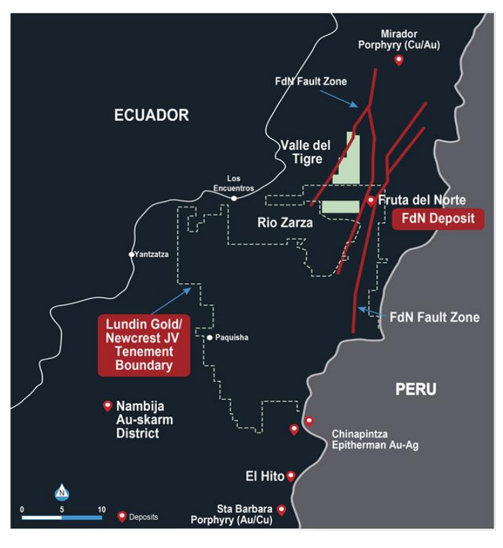
Figure 1: Valle del Tigre II Location

The Valle del Tigre II project is a grassroots stage, exploration project in the highly prospective Cordillera del Condor mineral belt of southeast Ecuador. Valle del Tigre II boundary is situated approximately 2.5 km northwest of Lundin Mining's Fruta del Norte, epithermal Au-Ag deposit (7.35 M oz Au @ 9.61 g/t Indicated Resource) and approximately 15 km southwest of the Mirador Cu-Au porphyry deposit (3.2 Mt Cu, 3.4 Moz Au, and 27.1 Moz Ag in proven and probable reserves) owned by CRCC-Tongguan Investment Co., as shown in figure 1. The property is underlain by the same sedimentary rocks and lies within the same rift faulting corridor as Fruta del Norte.