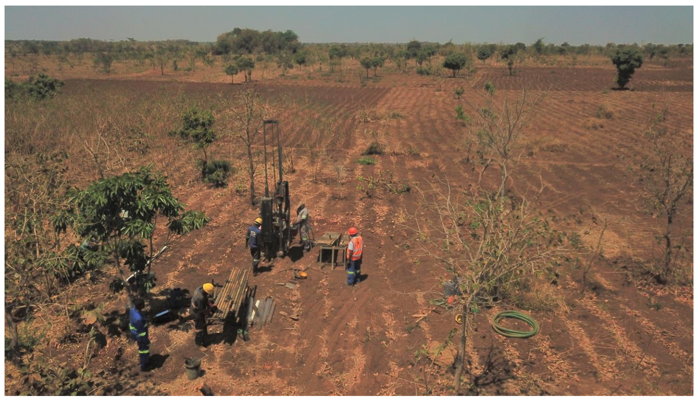
Figure 4: Drone photograph of the push-tube core rig in action at Kasiya.