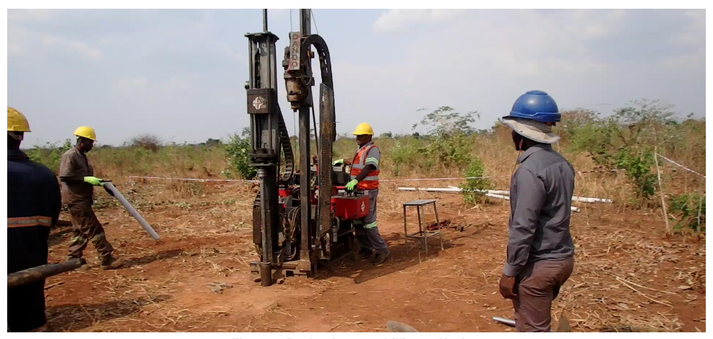
Figure 3. Push-tube core drilling at Kasiya.

The core drilling program included 36 holes for a total of 437m. The samples have been prepared and despatched to Perth for final analyses.