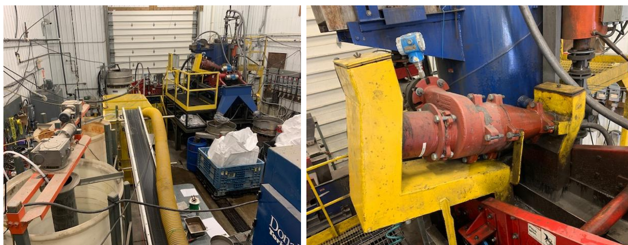
Figure 3 – Pilot Plant Setup at SGS Canada

The pilot plant will process over 50 tonnes of mineralized pegmatite collected from 17 locations across the Company’s Core Property in February 2020. Samples were collected from near surface pegmatites located in areas of early, middle, and late year production.