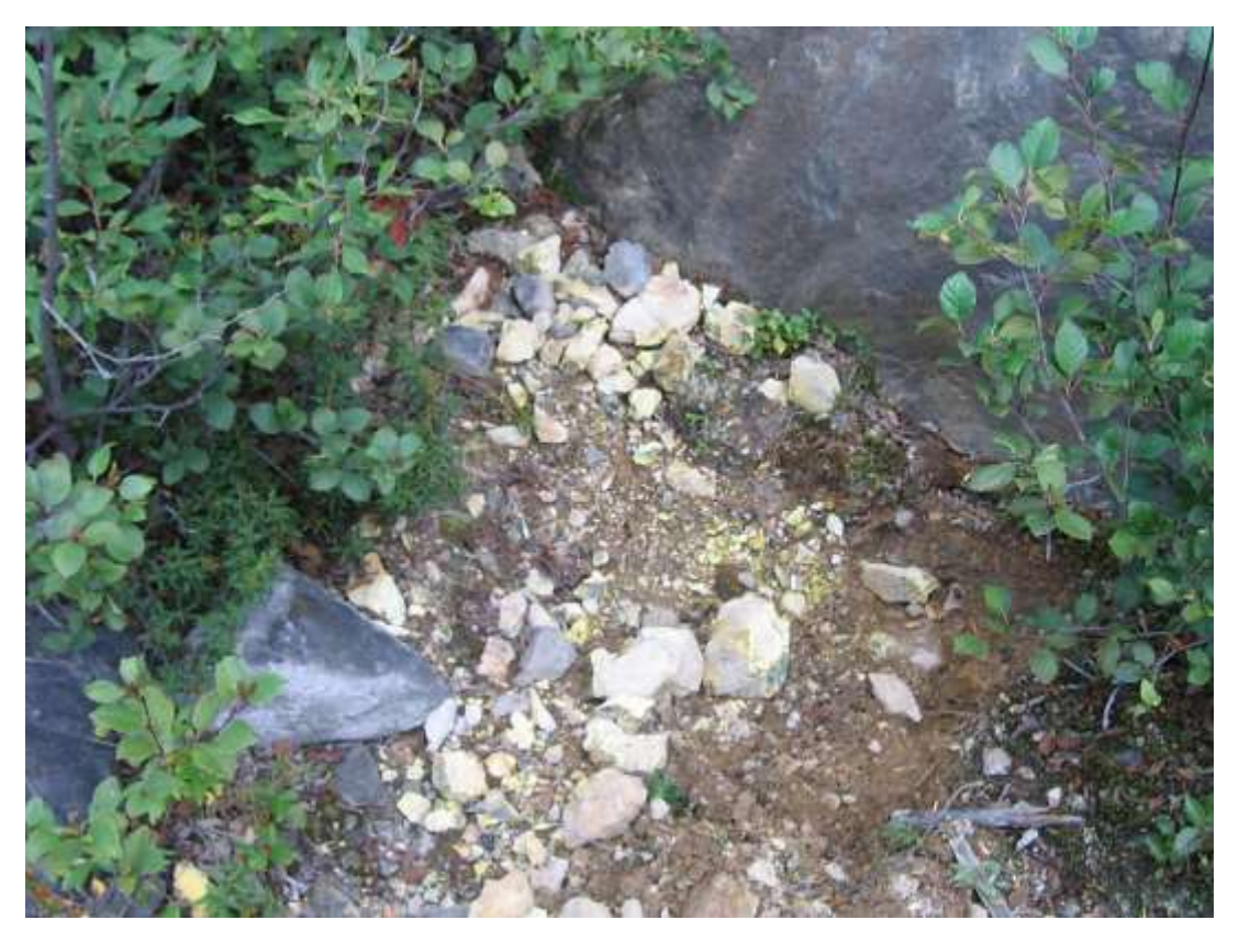
Figure 2: Uranium Scree from Hook Lake Project