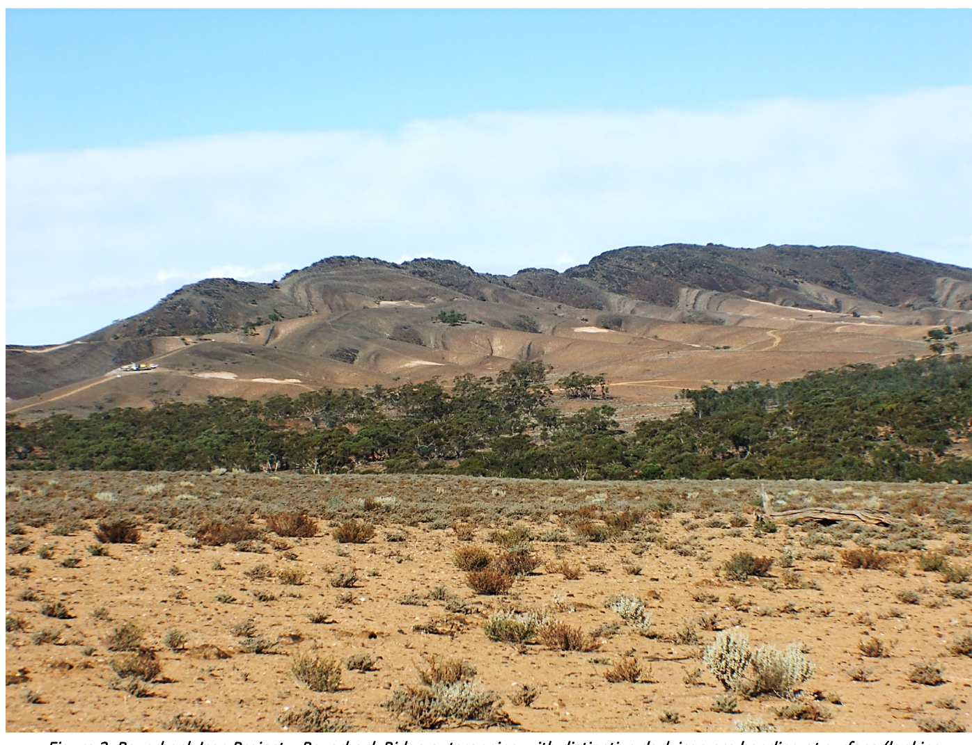
Figure 2. Razorback Iron Project – Razorback Ridge outcropping with distinctive dark iron ore banding at surface (looking south west)