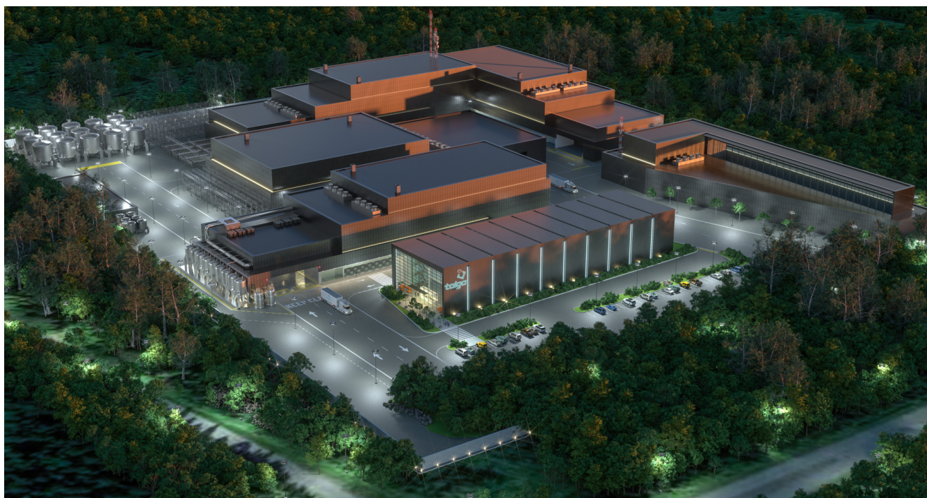
Figure 1. Illustration of Talga's planned battery anode production refinery in Luleå, Sweden.

Following execution of binding agreements for construction and operations, ABB will utilise its industrial automation and electrification expertise to develop and co-ordinate an extensive suite of production control and process solutions for Talga's operations, planned to commence 2023.