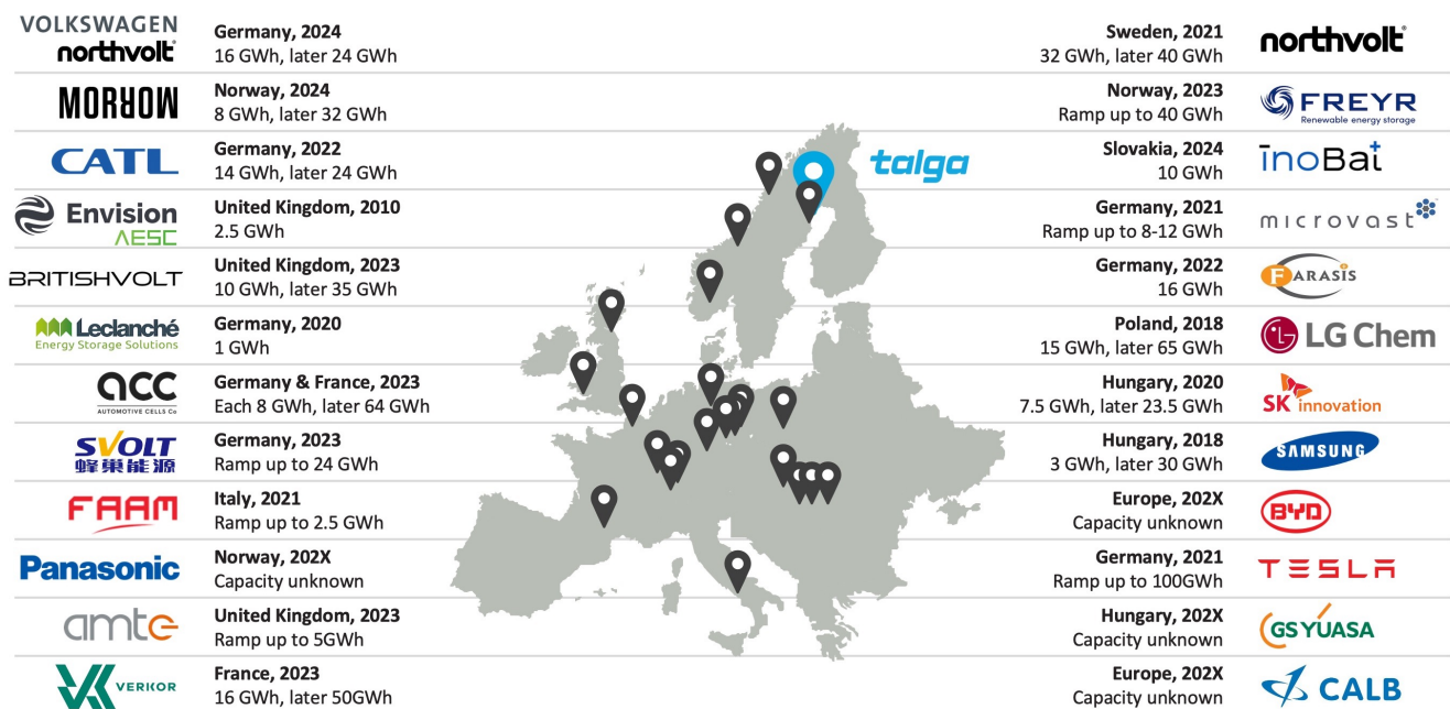
Figure 2. Updated (Q1 2021) announced European battery megafactories by Roland Zenn, Farasis Energy. The total 600GWh annum production capacity could equip 9-10 million electric vehicles annum and require 600-700,000 tonnes annum anode product such as Talnode®-C.

Further studies and work have commenced towards lodging initial development permits in the latter half of 2021. It is envisaged that a feasibility study on the combined Vittangi project graphite resources will be completed in future to support unified development of the project area as a whole.