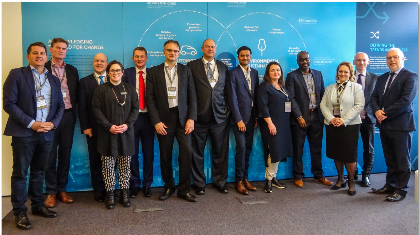
Figure 4. Talga staff with range of UK government and industry agencies working on the transition and transformation to de-carbonised automotive and transport manufacturing in the UK.

The studies will review the potential growth opportunities for Talga of having additional production sites close to planned UK battery megafactories. Additionally, the outcomes of the study are expected to identify potential production sites and assist in the engagement with funding sources currently supporting the electrification of the UK automotive industry.