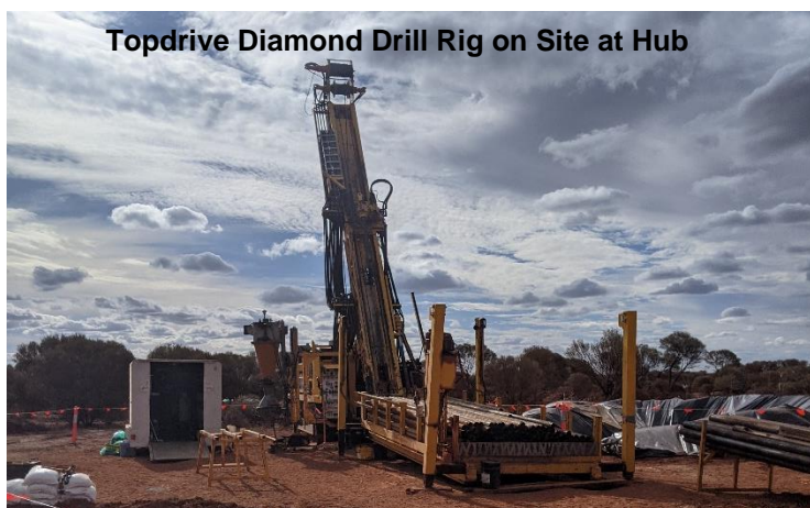
Topdrive Diamond Drill Rig on Site at Hub

“The granting of the ML over Hub is a key approval to enable the potential development of the deposit, and timely given the recent announcement of the merger between NTM and Dacian Gold Limited (ASX 16 November 2020). Infill drilling will allow an updated mineral resource estimate at Hub, with a focus on the near surface high grade mineralisation. The updated resource will be a key plank in enabling the merged group, subject to shareholder approval, to build momentum and maximise the benefits of the combined asset base. “