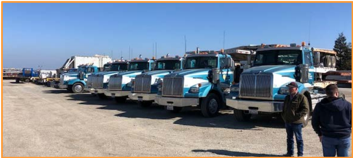
Trucks ready for Rig 5 Mobilization from Graham Drilling Yard in Rio Vista

Sacgasco Limited (ASX: SGC) ("Sacgasco" or "the Company") is pleased to announce that a drilling contract has been signed for the Graham drilling Rig 5 to drill the Borba 1-7 Well in the Northern Sacramento Basin onshore California. The rig is now mobilizing to site and drilling will commence within 1 week. As shareholders are aware, the drilling location is already in place and the cellar and surface conductor casing is in place.