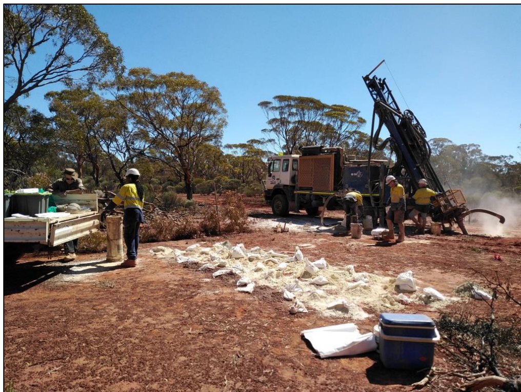
Zuleika Gold team - Aircore drilling at Paradigm East – February 2021