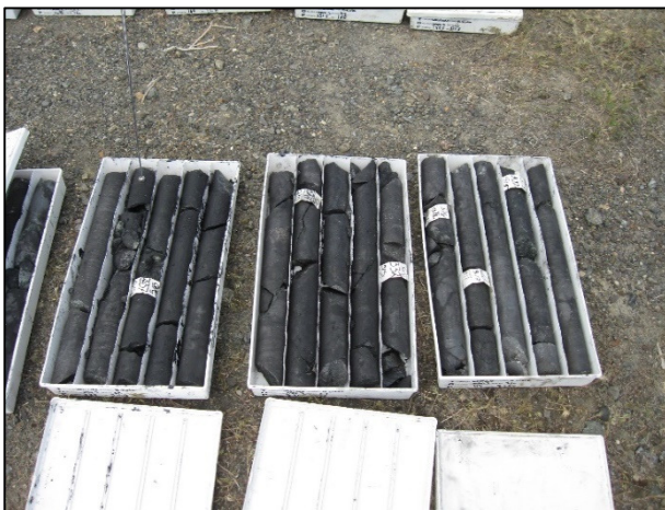
Figure 3: Massive magnetite in drill core

The Buena Vista project, which was discovered in the late 1890's, has a history of successful DSO operations.