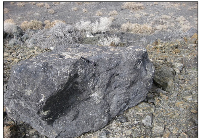
Figure 4: Massive lump magnetite

As an example, in the late 1950's to early 1960's in the order of 900,000 tonnes of magnetite ore with an estimated grade of 58% Fe was produced and sold into, we understand, the US domestic and Asian markets.