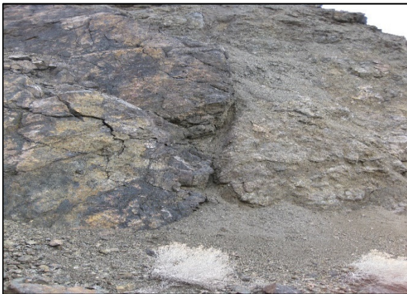
Figure 1: Massive magnetite outcrop

Importantly the production of a DSO product would also provide the project with an opportunity to take advantage of the latest bank forecasts for ongoing bullish iron ore prices.