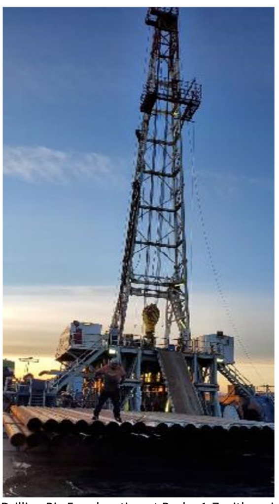
Graham Drilling Rig 5 on location at Borba 1-7 with casing ready.

Sacgasco Limited (ASX: SGC) ("Sacgasco" or "the Company") is pleased to announce that Graham Drilling Rig 5 spudded the Borba 1-7 Natural Gas Well in the Northern Sacramento Basin onshore California on Monday. The rig is now drilling ahead in 17 ½" hole to a planned depth of some 1,800 feet where 13 3/8" casing will be set to seal off and protect freshwater aquifers. Current Measured Depth is 262 feet.