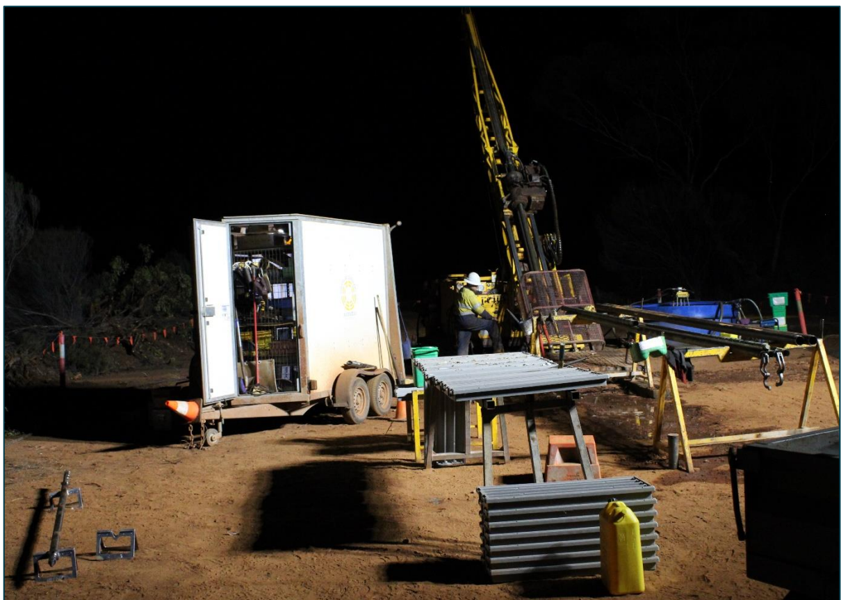
Figure 4: Topdrive Drillers Australia diamond drill rig night shift drilling on hole VDD001 at the First Hit Project.