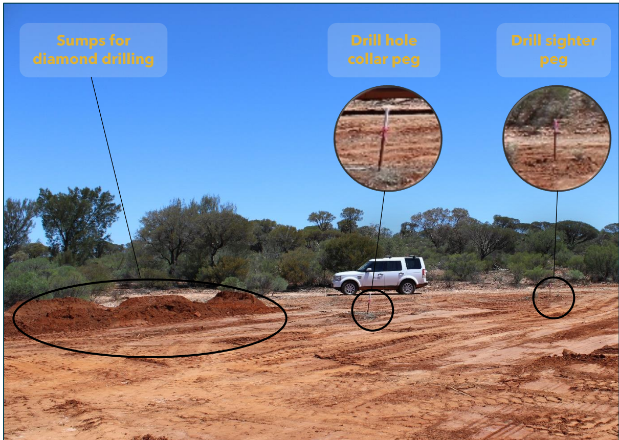
Figure 2: Drill pad for hole VDD011 cleared ready for drilling.