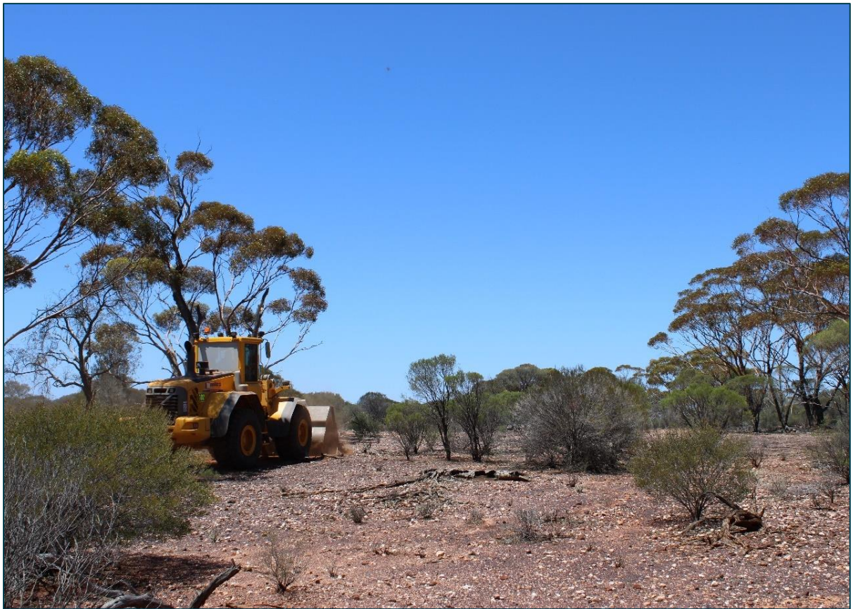
Figure 3: Loader clearing AC lines for drill rig access.