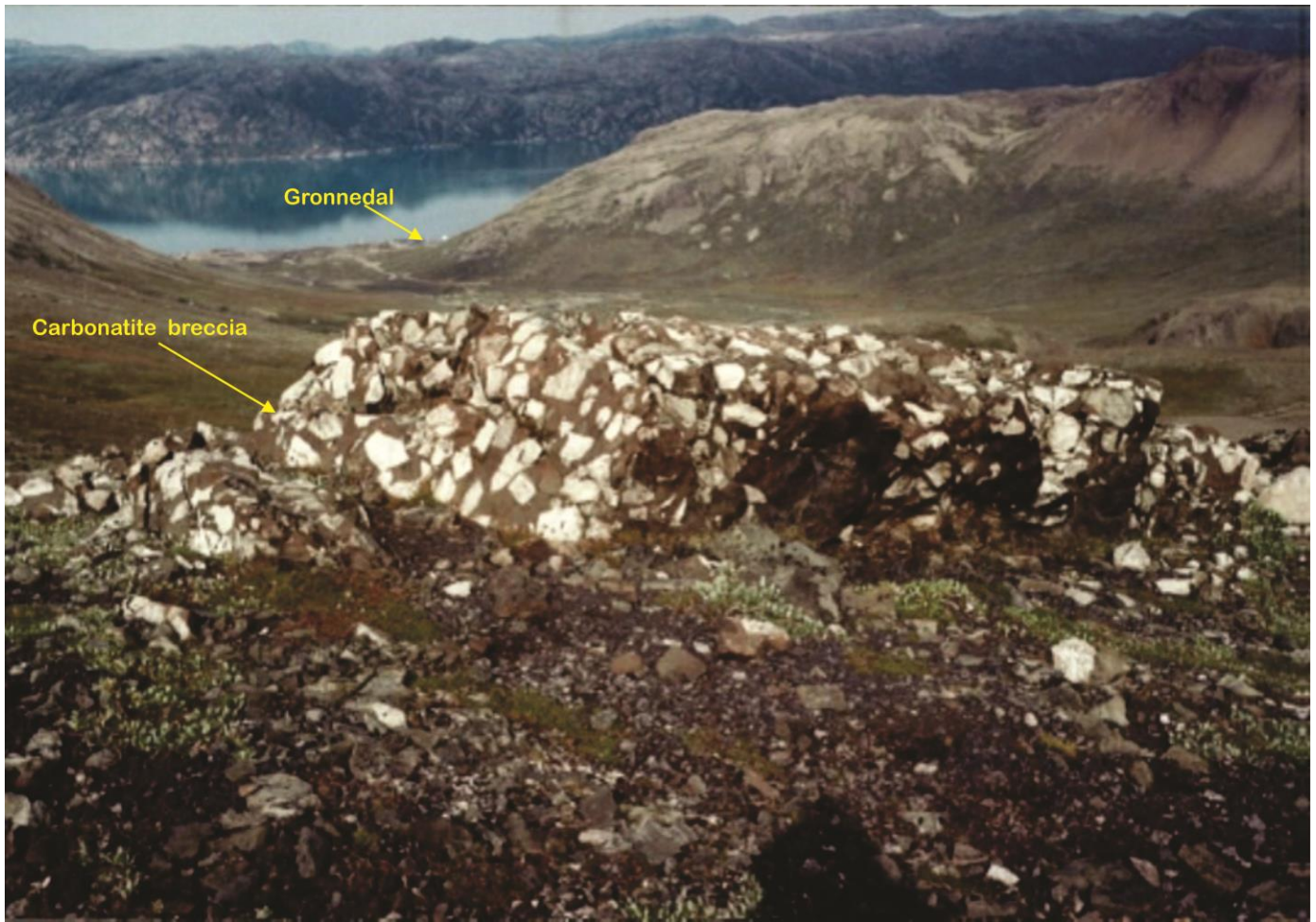
Figure 1: Carbonatite Breccia with large carbonate fragments – Gronnedal settlement in the background

of Kangilinnuit and Gronnedal, respectively provide a heliport and an active wharf with infrastructure. The Gronnedal-Ika carbonatite complex is less than 10km from Ivittuut and only 5km from the port of Gronnedal. This complex is also one of the 12 larger Gardar alkaline intrusions in Greenland and is recognised as one of the prime REE targets in Greenland by GEUS along with Kvanefjeld and Kringlerne (Tanbreez).