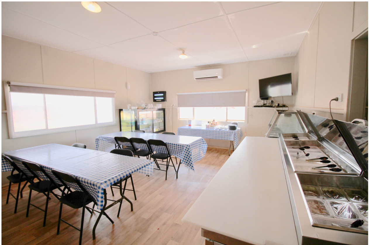
Figure 5: Tarmoola Exploration Camp Mess Hall