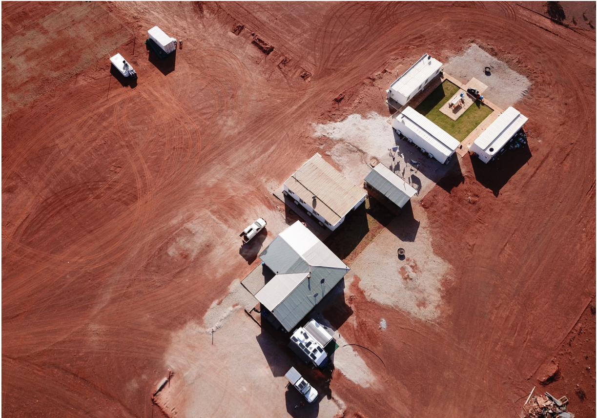
Figure 2: Tarmoola Exploration Camp