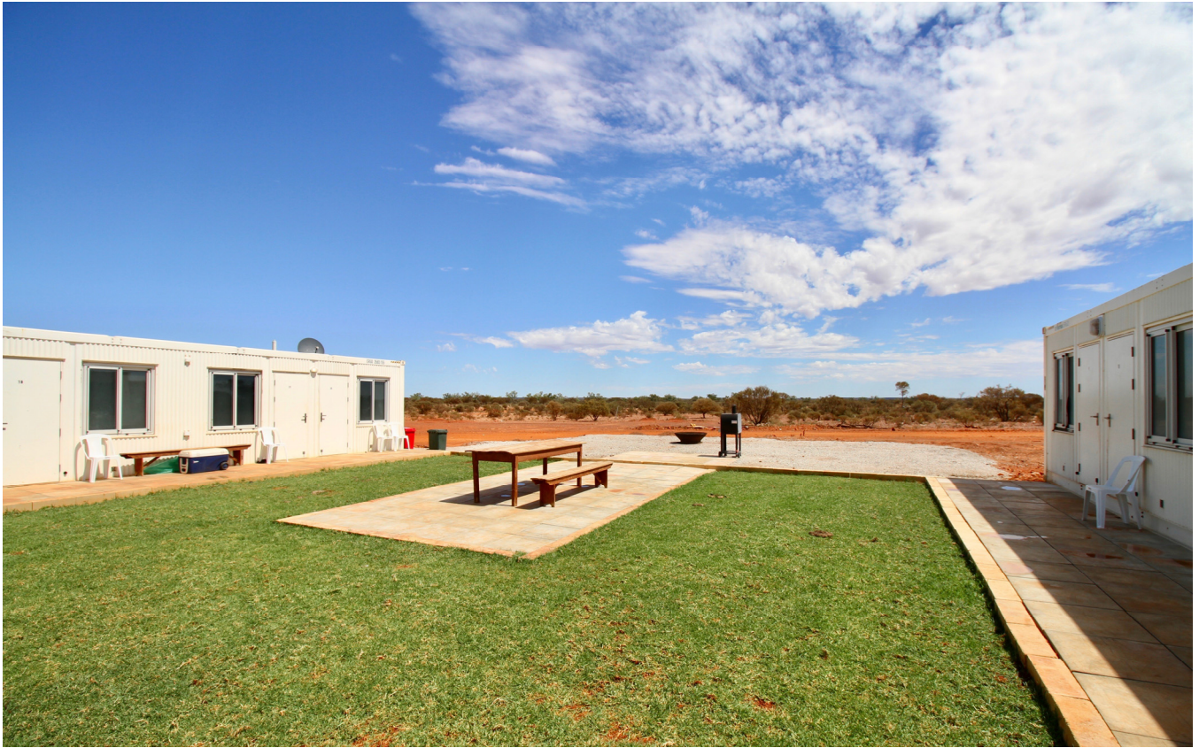
Figure 8: Tarmoola Exploration Camp

This announcement has been authorised for release by the Board.