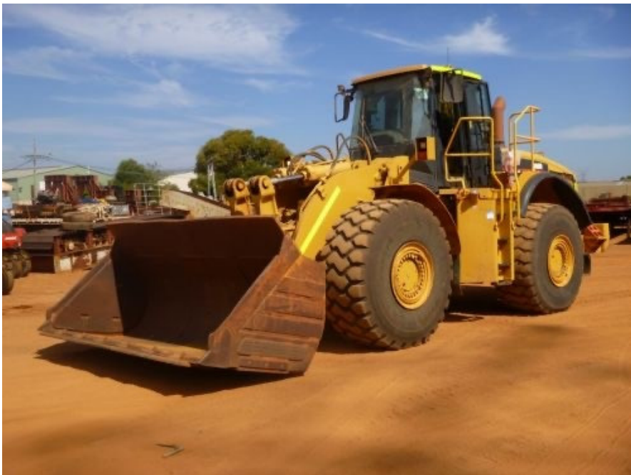
Figure 7: Carhill Contracting Earth moving equipment