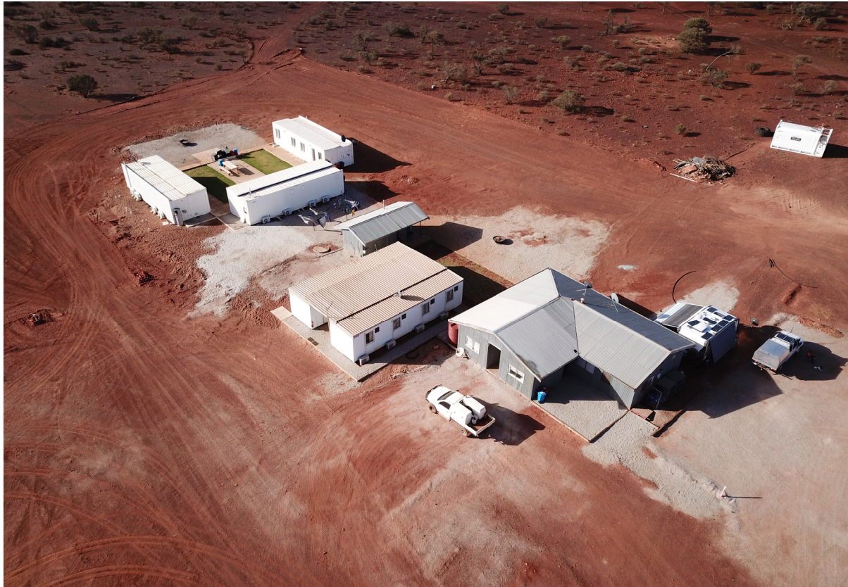
Figure 3: Tarmoola Exploration Camp (NW view)