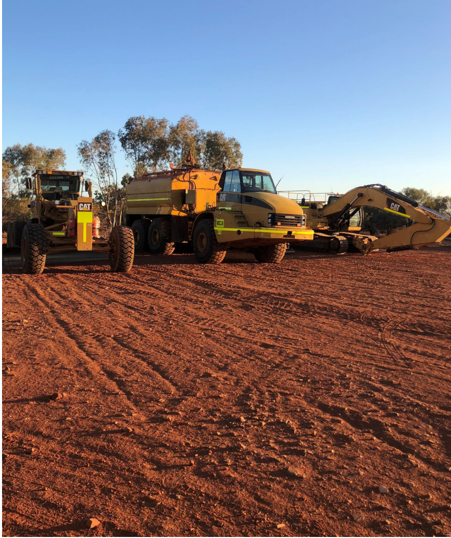
Figure 6: Carhill Contracting Earth moving equipment