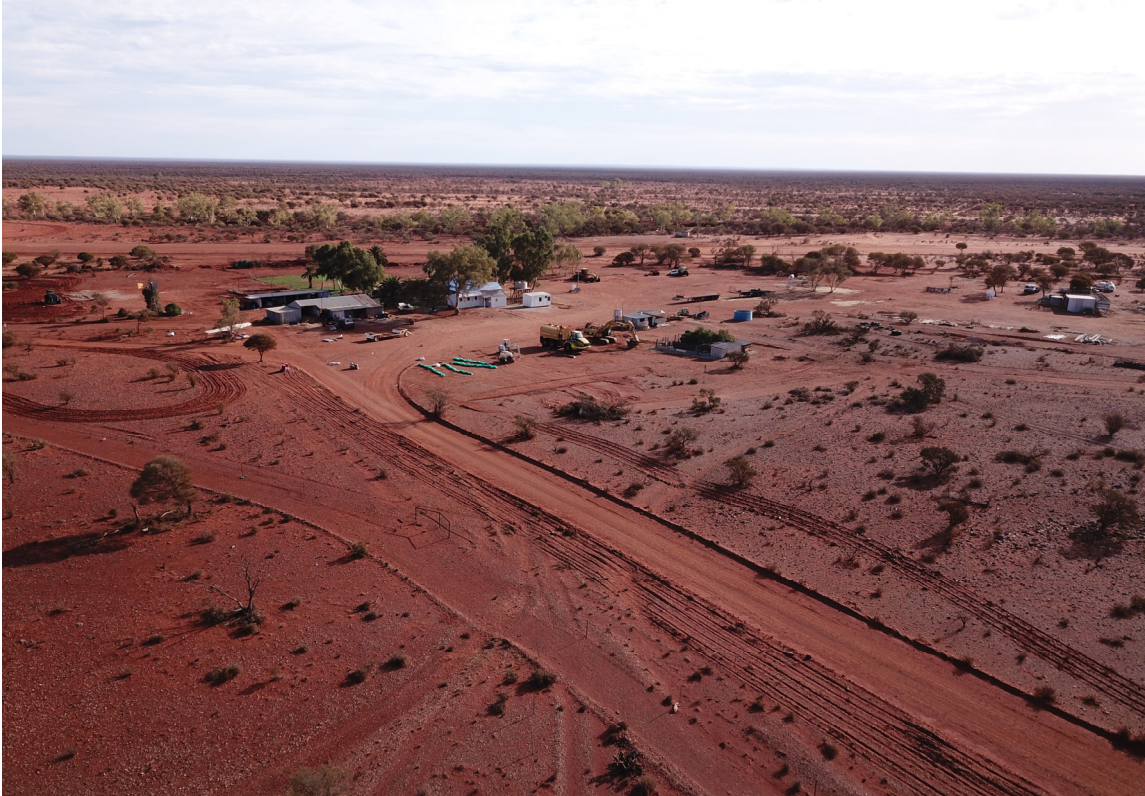
Figure 4: Tarmoola Station (SW view)