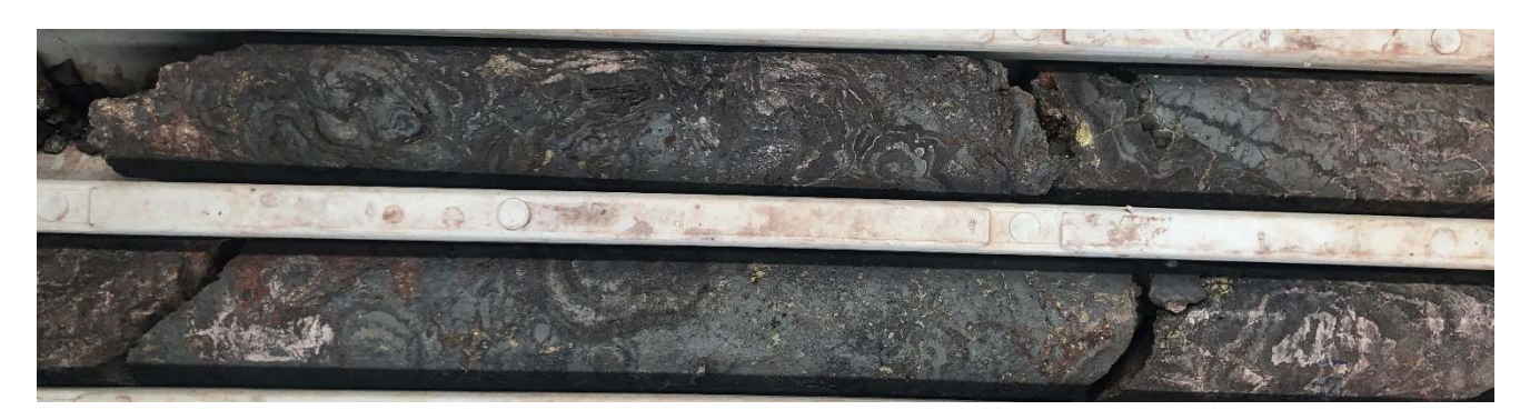
Figure 3: VUD018, colloform massive hematite breccia at ~1387m, NQ core.

Thick zones of massive hematite breccia , comprising 70-100% hematite with minor intervals of altered quartzo-felsdapthic gneiss and mafics were intersected from 1210 to 1271.2 and from to 1287.5 to 1353m. Further down the hole, hematite breccias containing 40 to 70% hematite were intersected from 1371.4 to 1408 and 1445-1479m downhole and are interspersed with altered mafic breccia, mafics and quartzo felspathic gneiss.