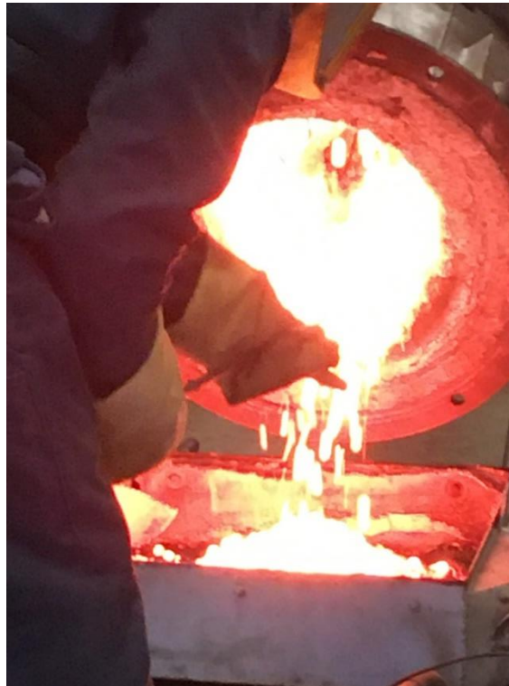
Figure 1 Pellets being unloaded from the pot grate.

and is a significant step towards the Company's goal to design, build and operate the world's lowest cost primary vanadium operation which will be located in Western Australia's Mid-West region.