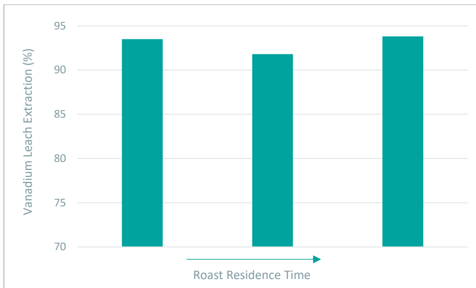
Figure 3. Effect of roast residence time on vanadium extraction

roasting durations no appreciable difference in vanadium leach extraction resulted, indicating a robust process and rapid completion of the salt-vanadium reaction.