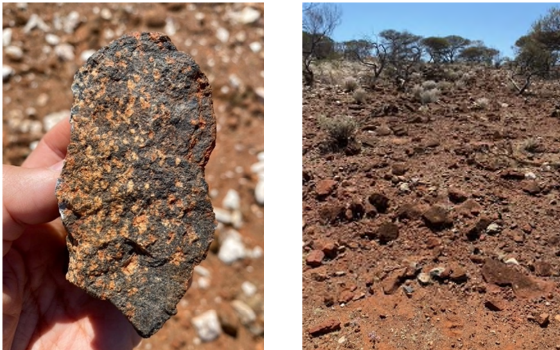
Figure 3, Outcropping PGE mineralization at the Barracuda PGE-Ni-Cu Project.

No further holes were drilled and no further exploration for magmatic PGE-Ni-Cu sulphide has been conducted within the area since 1990. Pancon relinquished its exploration license (E58/41) in August 1991.