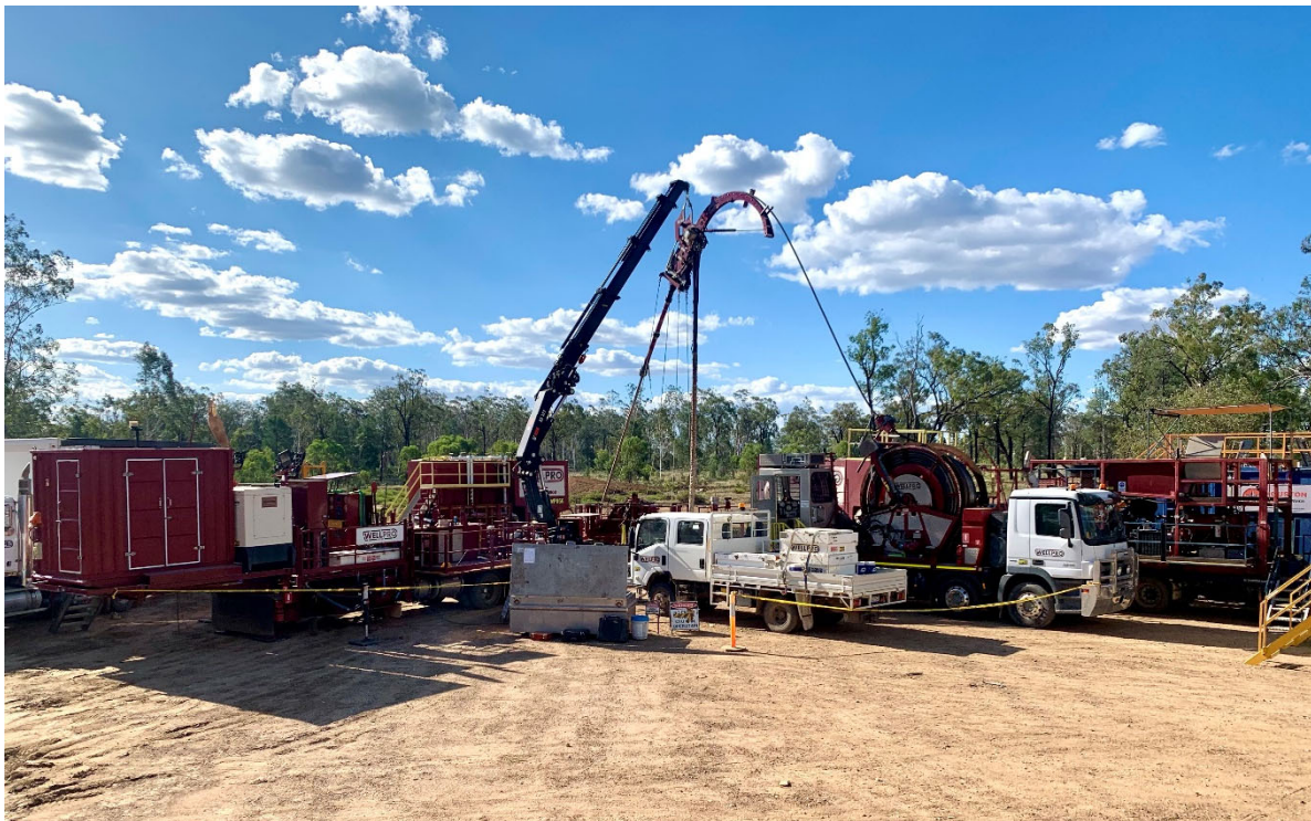
Venus 1 pilot well reservoir enhancement in progress.

The next stage is to set up the well for an initial 3 month duration flow test. The work to set up the well for flow testing is planned to start next week with the flow test scheduled to commence by the end of the month.