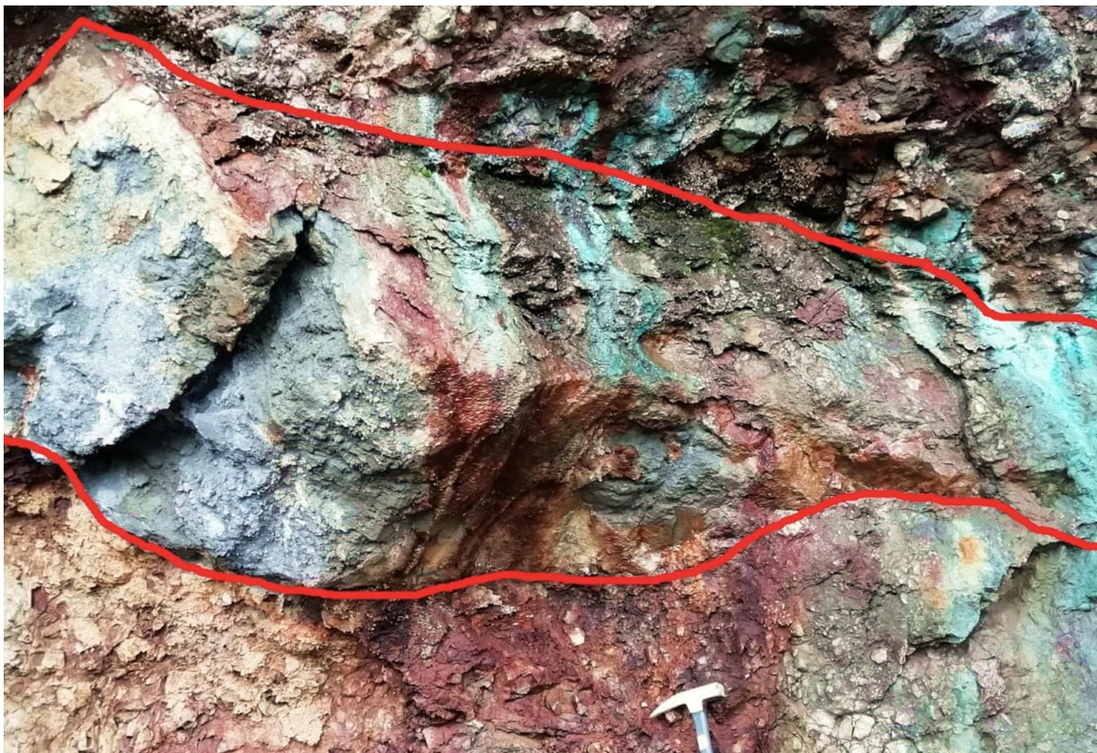
Figure 1: Outcropping massive sulphide lens (chalcopyrite & malachite)

Alta Zinc Limited (Alta or the Company) (ASX: AZI) is pleased to announce that it has lodged applications for two exploration licences (ELs) encompassing two of the most commercially significant copper mining districts in Italy. Examples of outcropping mineralisation at the Monte Bianco EL (Libiola site) are in Figures 1 and 2.