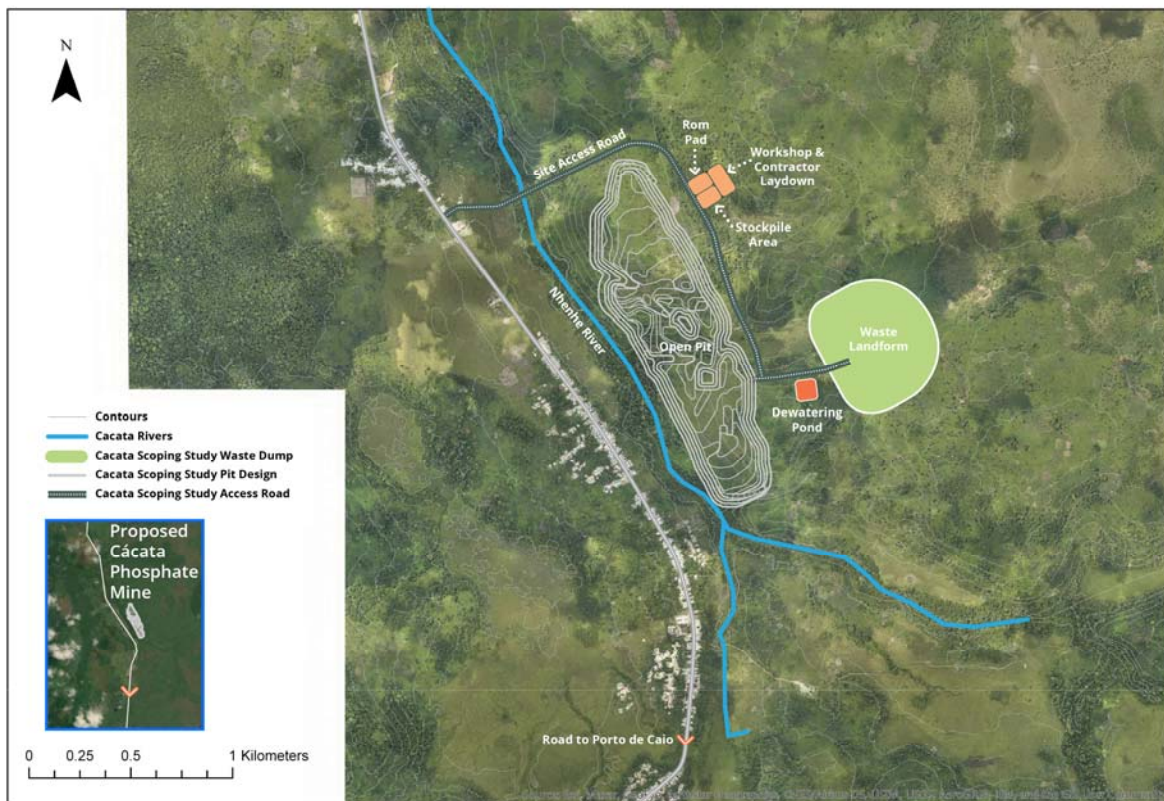
Figure 2 - Cácata Phosphate Deposit with planned pit shell, waste landform, and stockpile area proximal to dual lane highway, local village, and water source.

The Cácata deposit is a uniquely low-impact mining project, with a relatively small environmental footprint (Figure 2) and long operational life. The Cabinda Phosphate Project's planned small open-pit operation at the Cácata deposit measures less than 2km in length with the mining amenities positioned around the pit and close to a local workforce. The mine will also be located right next to the sealed dual carriage highway which is 50km from the proposed granulation plant at Port de Caio.